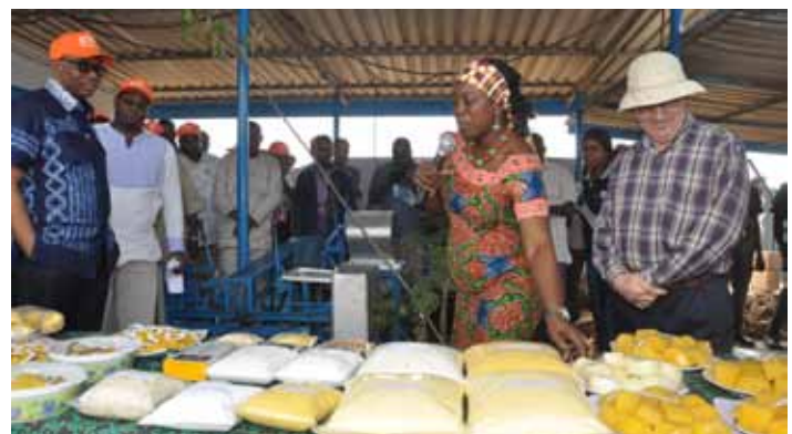
Opportunities also exist in cassava processing.