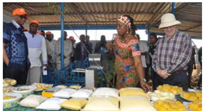
Opportunities also exist in cassava processing.