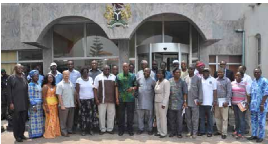
Ondo State entourage with FARA BoT, IITA Management, and FUTA officials in Ondo State.