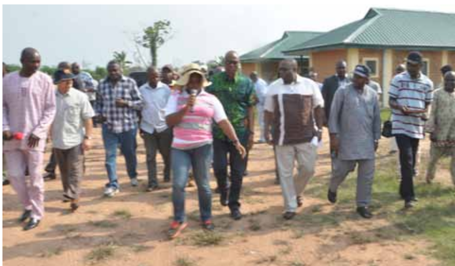
Ondo State entourage with FARA BoT, IITA Management, and FUTA officials on a guided- tour of one of the agricultural villages in Ondo.

Again this is another area in which we are hoping to collaborate with research institutes like IITA and FARA to take Ondo State to the next level.”