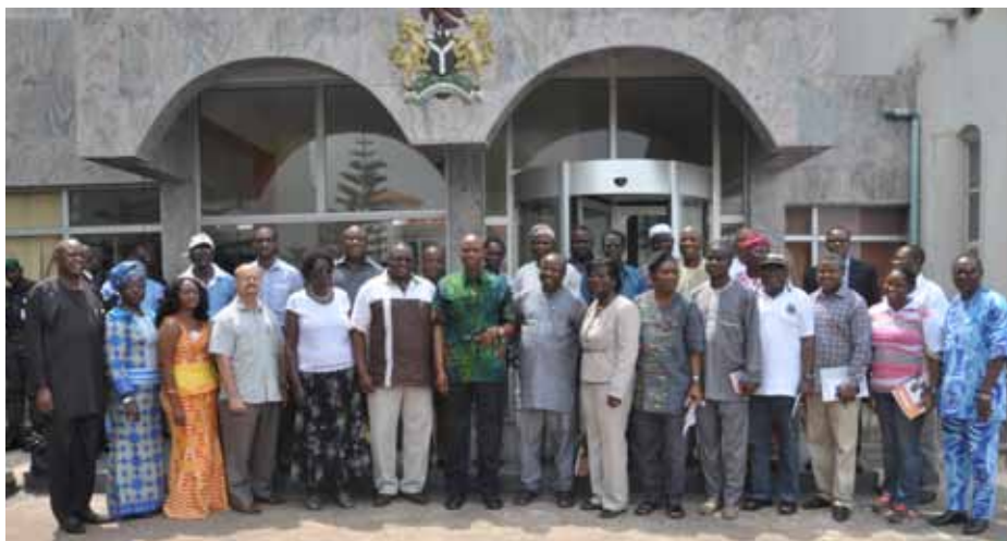
Ondo State entourage with FARA BoT, IITA Management, and FUTA officials in Ondo State.