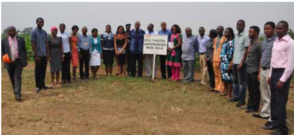
IITA expertise as exemplified in the youth project can be extended to Ondo to help tackle the challenge of youth unemployment using agriculture as a tool. Governor Mimiko with FARA, IITA, and FUTA officials with members of IITA Youth in Agriculture project pose for a group photo.