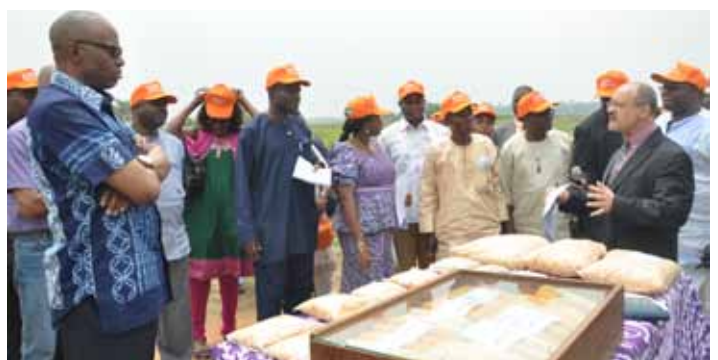
Maize seed multiplication is another goldmine.