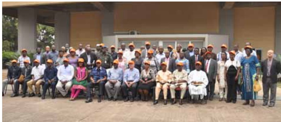
Ondo State entourage with FARA BoT, IITA Management, and FUTA officials, IITA.

“We said the strategy to do this is for our government to subsidize and give support for inputs (mechanical tractors, improved seedlings, and extension work) and we have done that for the past four years. In the last five years we have spent N7 billion to support agriculture in the state. Somewhere along the line, we decided that the best way to get new, young entrepreneurs into agriculture was to build agricultural villages—a new agricultural environment with accommodation, and using modern agricultural tools. We built three villages and renovated one farm village and we have been able to get youths to work on this farm. But there is no question about the fact that we still have a lot of gaps in terms of technology, and technical know-how in market access to be able to make a resounding success of this effort,” he said.