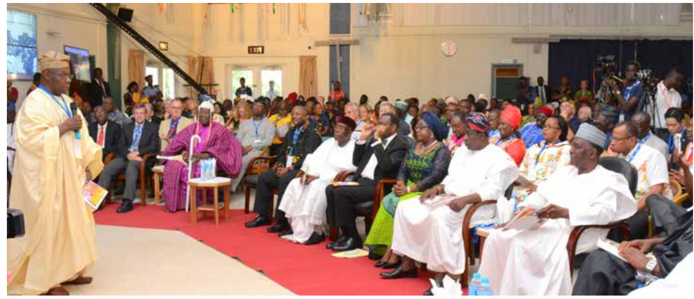
Former Nigerian President Olusegun Obasanjo chairing the main celebration program.