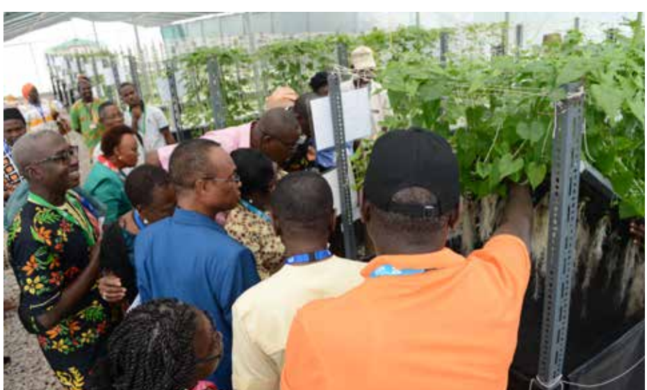
Alumni being given a grand tour of IITA facilities and new initiatives at IITA.