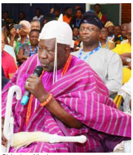
Olubadan of Ibadan.

"Your research efforts have to spread far and wide for us to produce crops that are resistant to diseases," HE stated.