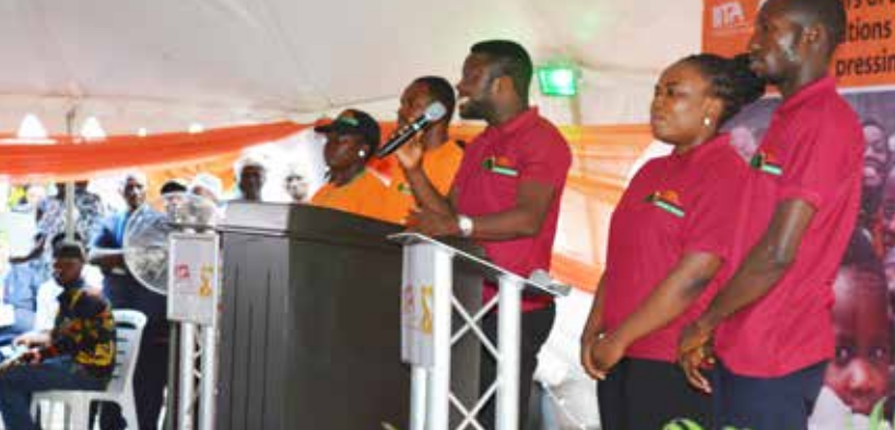
The audience cheer for Agripreneurs (right) debating on the topic "Agribusiness start-up for youth: Loan vs. grant.