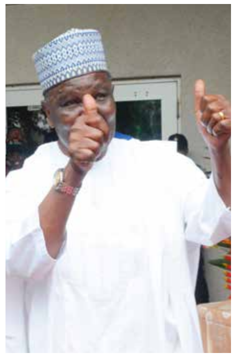
Above: Gen. Yakubu Gowon giving staff the thumbs up sign.

Gen. Gowon congratulated IITA on the celebration of its Golden Jubilee and urged the organization to promote youth-led agricultural enterprises.