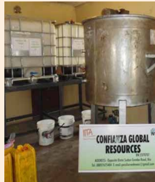
Mercy's business on groundnut oil processing.

Mercy says groundnut processing is a profitable business as a ton of good groundnut seed produces