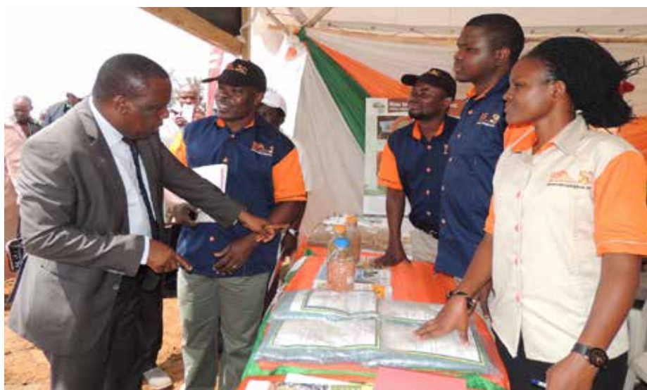
Dignitaries visiting the IITA booth.

nongovernment organizations, and private entrepreneurs who took part in the exhibitions where the Institute showcased inoculants (BioxFix, Nodumax, LegumeFix), biocontrol technologies for combating aflatoxin (Aflasafe), postharvest storage technologies (Collapsible Dryer Case), and value-added products made by the Tanzania Youth Agripreneurs (TYA) such as cassava flour (Mpishi Mkuu brand), cassava flour products (strips, chinchin, "visheti", gari), and yellow maize flour produced from vitamin A yellow maize.