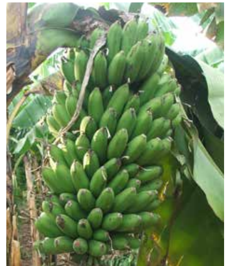
Banana is a staple food in most of East Africa.

"The long-term resilience of banana production systems can only be improved through continuous monitoring, robust containment strategies, strengthening