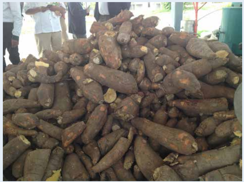
Cassava is a staple root crop in many African countries.

--From <u>http://www.cirad.fr/en/news/</u> <u>all-news-items/press-releases/2018/</u> rtbfoods