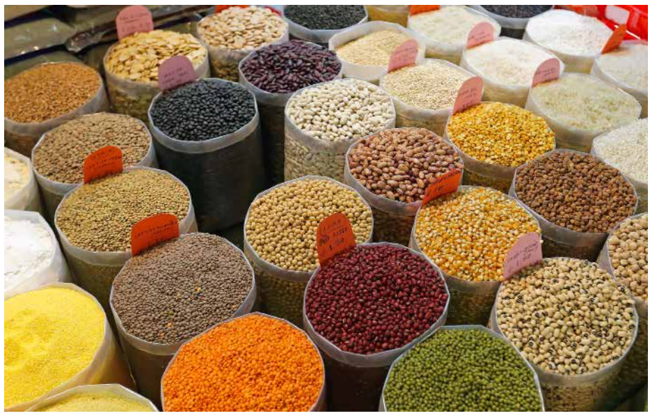
TAAT aims to increase agricultural productivity and diversification, improve socioeconomic status of farmers, and create jobs for millions of Africans.

The multi-year, multi-partner TAAT program was conceptualized based on "Africa Feeding Africa," a core priority of AfDB and aligned with the Bank's Ten-Year Strategy (2013- 2022) for inclusive and green growth in the continent. The program, aimed to revitalize African agriculture, was conceived in a high-level conference on African agricultural transformation attended by leading experts in agriculture, research