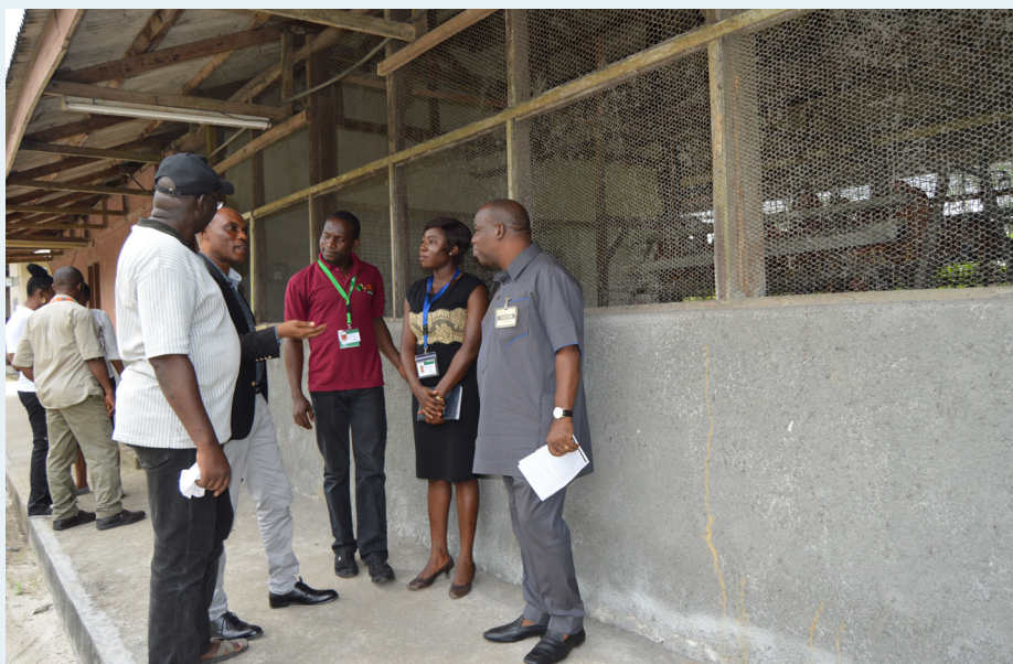
The IITA-Onne Youth Agripreneur explaining the youth program to the NDDC officials.