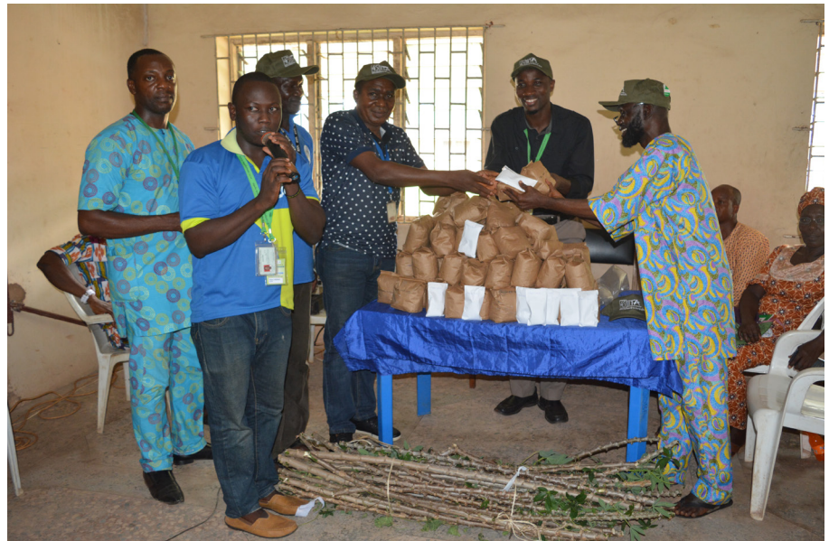
The program facilitators disseminating improved seed varieties to farmers in Ikenne LGA.

During the training course, specific emphasis on pest infestation, wrong use of herbicides, and low yield and income generation were highlighted by