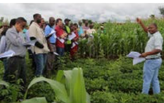
Participants at the first stop of the field visits.