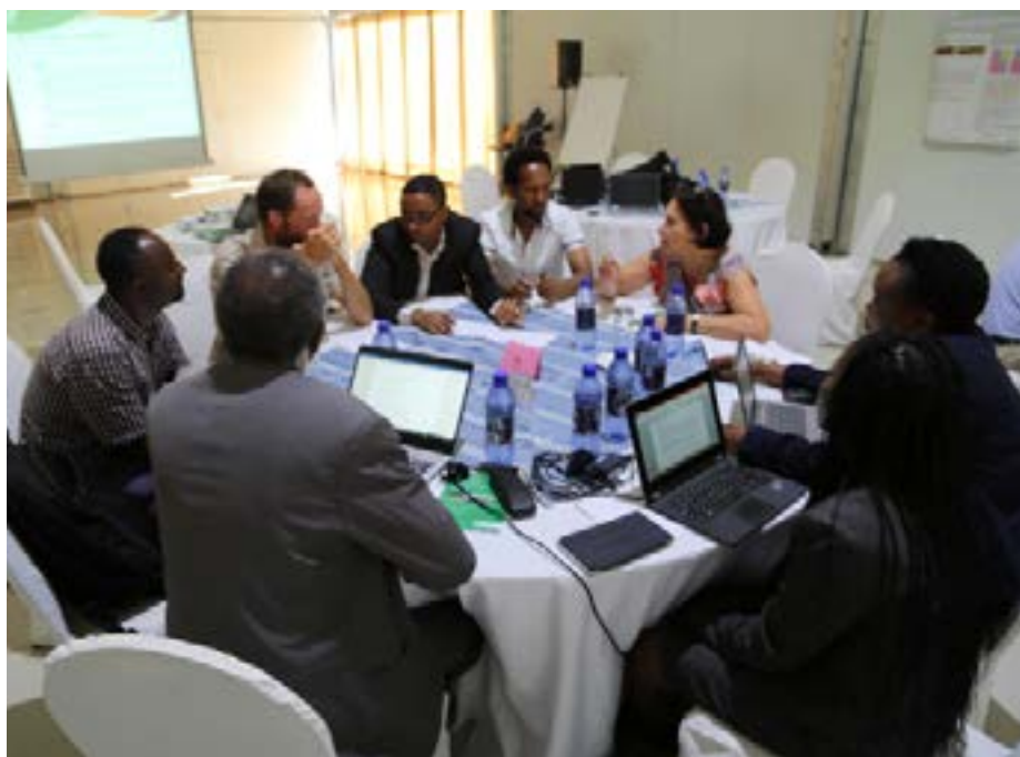
A group discussion in progress during the Africa RISING Program Learning Event held on 5 - 8 February 2019 in Malawi.

The input and feedback generated during this session of the Learning Event will be reviewed and some of it used to generate a near-final document that will be presented to the program coordination team for possible use within the whole program. Maybe then, William Shakespeare's famous quote in Romeo and Juliet – 'a rose by any other name would smell as sweet', will hold true.