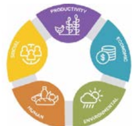
The five domains of sustainable intensification.

Try out the toolkit and radar chart generator.