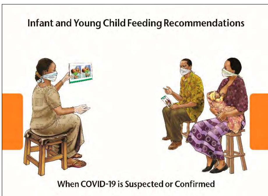
Infant and Young Child Feeding (IYCF) recommendations when COVID-19 infection is suspected or confirmed.

At the end of the workshop, participants developed their action plans to step down the IYCF training to participants in the LGAs they represent and use the knowledge gained themselves. The Activity conducted a post-test to confirm what they learned.