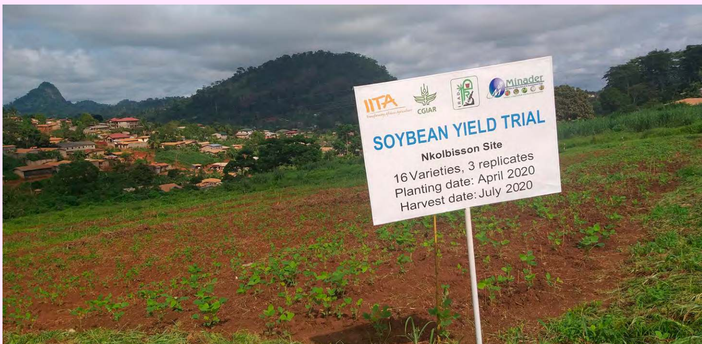
A soybean yield trial site in IITA-Cameroon.

mandate crops and staple foods for millions of people.