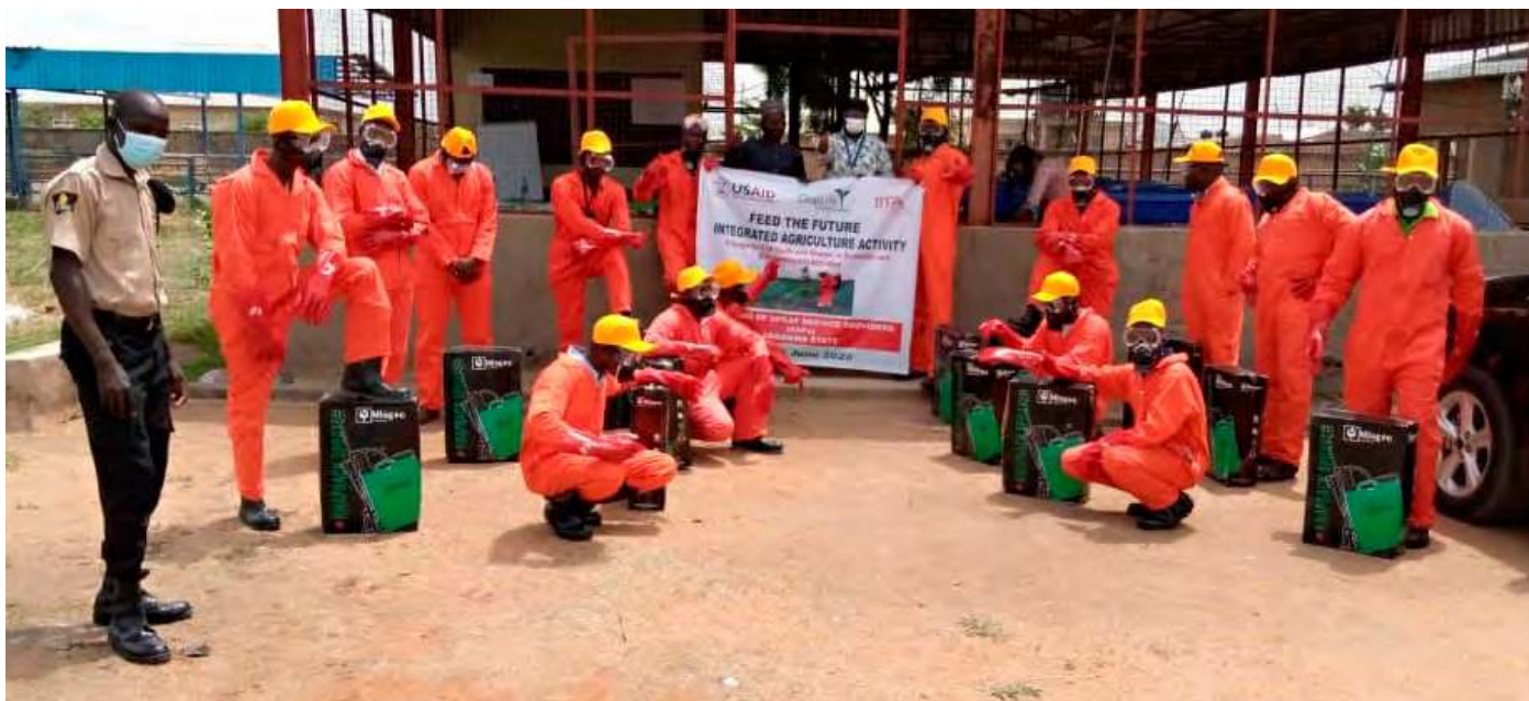
Adamawa State participants with training facilitators.