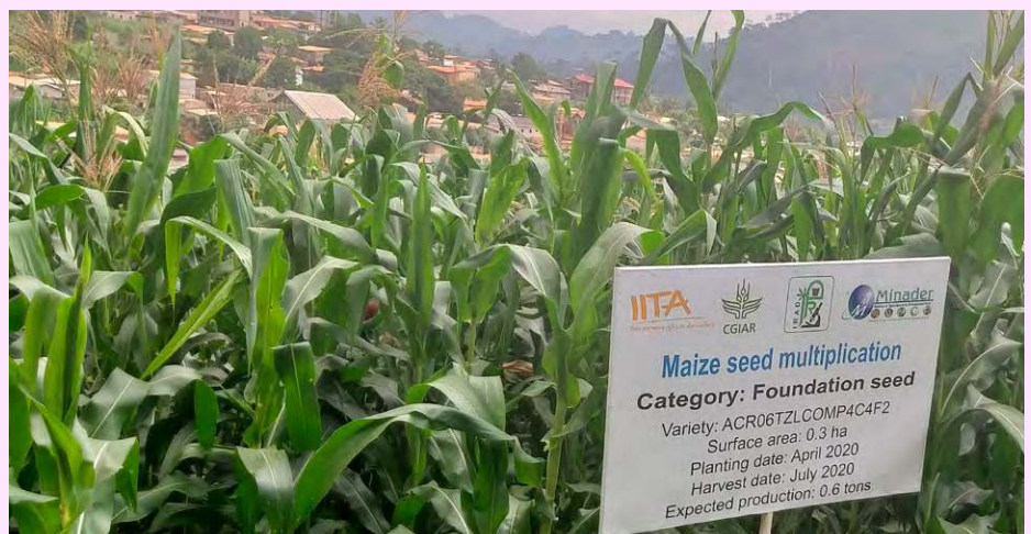
An IITA seed multiplication plot for maize.

During the COVID-19 pandemic IITA-Cameroon is providing high-quality seeds of improved crop varieties to smallholder farmers through the Ministry of Agriculture and Rural Development (MINADER). The seed legislation in Cameroon classifies seed into basic seeds, certified seeds, and standard (commercial) seeds. IITA, in collaboration with Cameroon’s Agricultural Research Institute for Development (IRAD), has the responsibility of producing basic seeds for major commodities such as cassava, plantain, maize, soybean, and cowpea, which are the Institute’s