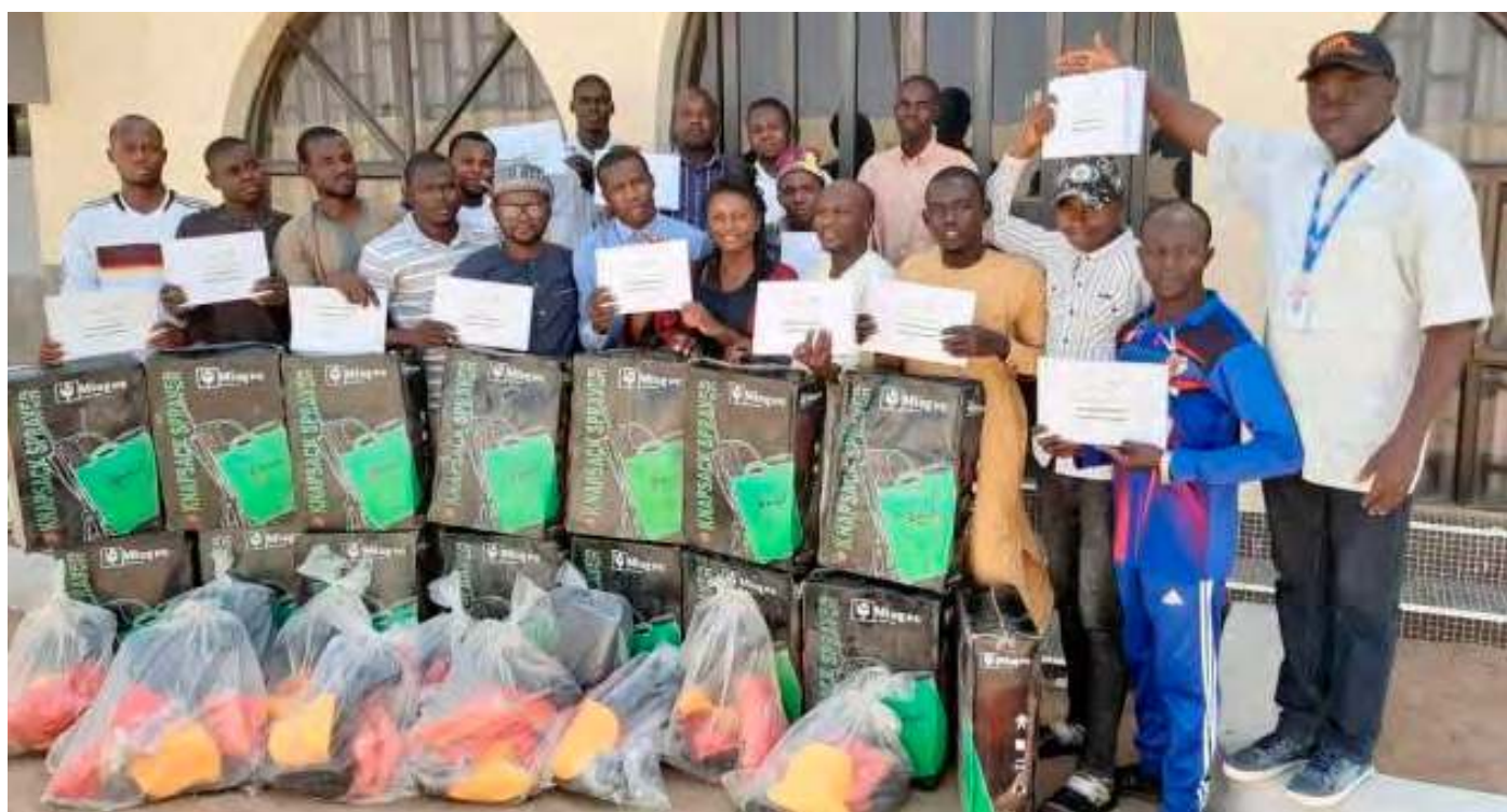
Borno State participants and IAA staff at the training in February 2020.

The IAA supported the participants with knapsack sprayers and complete PPEs, which included safety caps, protective eyewear, overalls, respirators, hand gloves, rain boots, and logbooks to commence their enterprise activities in the farming season.