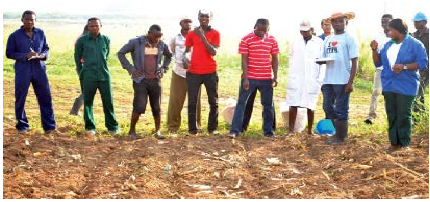
Youth agripreneurs on a field during land preparation.

CARE addresses youth unemployment and involvement in rural and non-rural economies by funding young researchers across Africa. The resulting studies are the basis for policy briefs that are used to engage parliamentarians in Africa to ensure that effective policies are drafted to address these development areas.