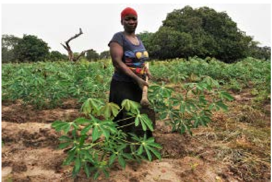
Top: An extension agent conducting yield assessment in a trial plot managed using AKILIMO recommendations. Bottom: AKILIMO tools provide recommendations that help farmers maximize their return on their cassava investments.