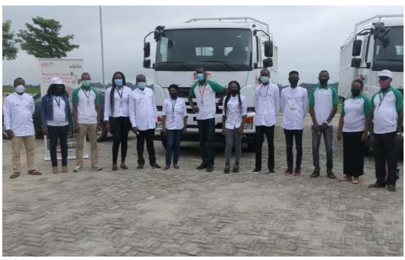
The GoSeed team standing before the trucks.

IITA GoSeed's partnership with the BASICS I project continues into BASICS II. GoSeed is also open for partnership to help provide quality and improved varieties of seed to seed companies and farmers. To collaborate and learn more about IITA GoSeed, visit <a href="https://www.iitagoseed.com">www.iitagoseed.com</a>.