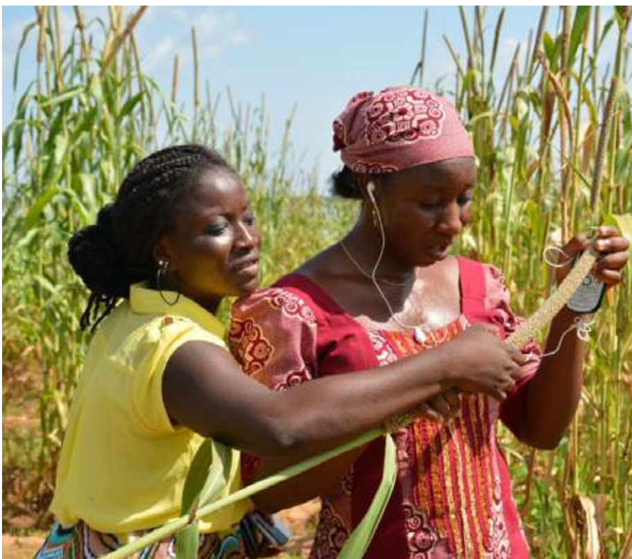
Female youth agripreneurs in the field, gathering data on pearl millet.

This research is one of several studies carried out by young Africans under the IITA -implemented CARE project, which the International Fund for Agricultural Development (IFAD) sponsors across 10 countries. CARE is proffering solutions to issues around youth engagement in rural economic activities and addresses the interrelated issues of implementing quality research and disseminating the results to stakeholders, which include policymakers in Africa.