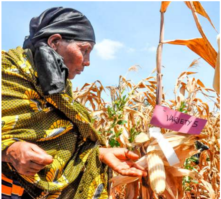
A female farmer taking part in a participatory variety evaluation as part the Africa RISING project.

"Gender is very important at IITA because we deal with issues related to improving the livelihoods of the society. We cannot achieve this goal in the presence of inequality and marginalized and vulnerable groups. Gender transformative approaches are needed to evolve towards an egalitarian society. The gender network is the engine that IITA has developed to guide the Institute and its members in that direction. In the last quarter, the network has made tremendous progress by attracting the interest of the IITA community, as shown by the large participation of staff from different disciplines and backgrounds. The new gender expert is the centerpiece contributing to that progress," explained Victor Manyong , IITA Director for the Eastern Africa hub.