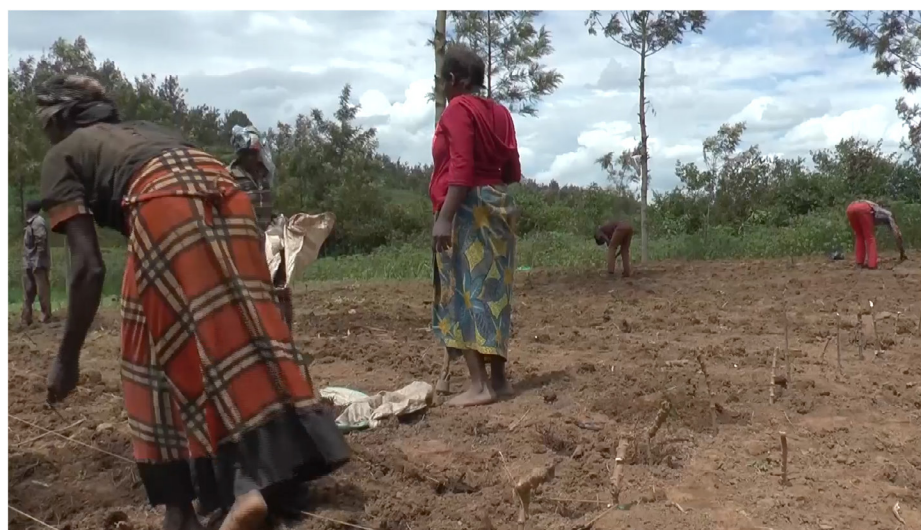
Top: Increased adoption of CSI technologies has resulted in increased crop yield and income. Bottom: CIALCA aimed to reduce poverty among smallholder farmers through increased farm productivity, household income, and improved nutrition.

IITA, in partnership with two other CGIAR centers, the International Center for Tropical Agriculture (CIAT) and Bioversity International, had been implementing the Consortium for Improving Agriculture-based