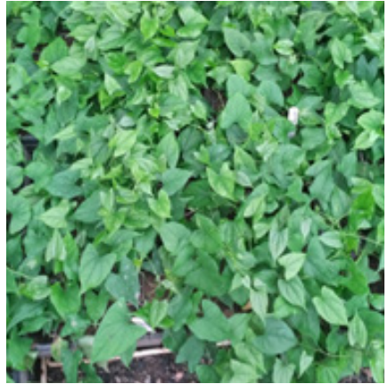
Plate 2.22. Vine cut from HS and rooted in trays