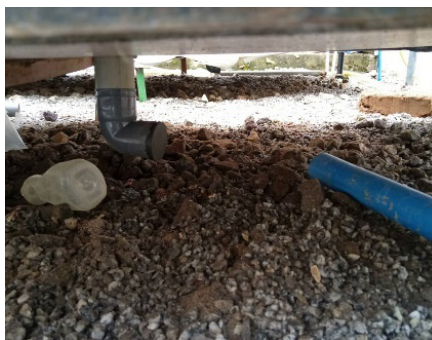
Plate 2.2. Bottom drainage in HS trough.