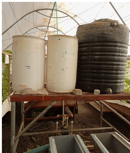
Plate 2.4. Scaffold with reservoirs for water and nutrient solutions.