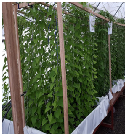
Plate 2.20. HS substrate with holes ready for planting.