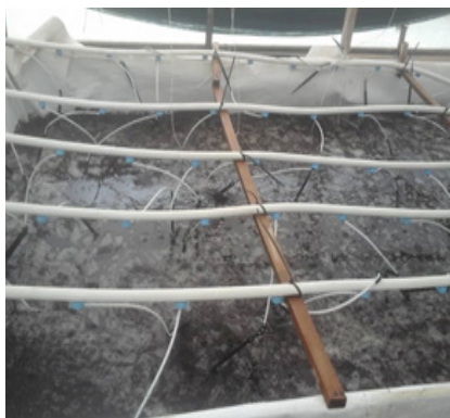
Plate 2.8. Disinfection of HS substrate.