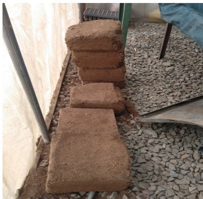
Plate 2.6. Cocopeat blocks.