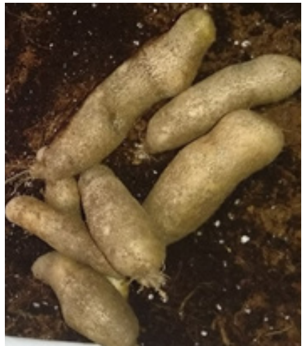
Plate 2.23. Tubers harvested from HS.