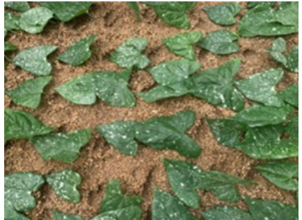
Plate 2.12. Freshly planted cuttings in sand (sandponics).