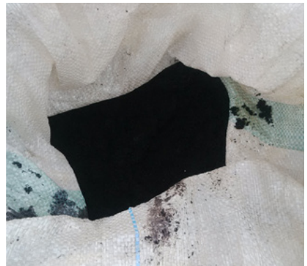
Plate 2.15. Carbonized rice husk.