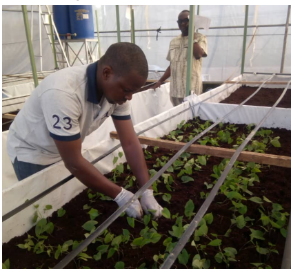
Plate 2.17. Planting in HS.