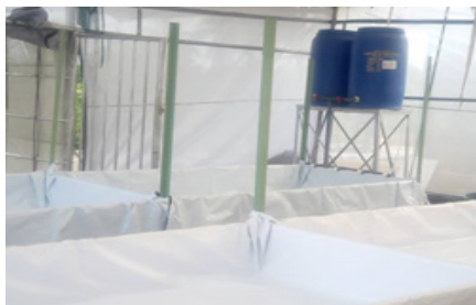
Plate 2.3 Wooden troughs lined with tarpaulin.