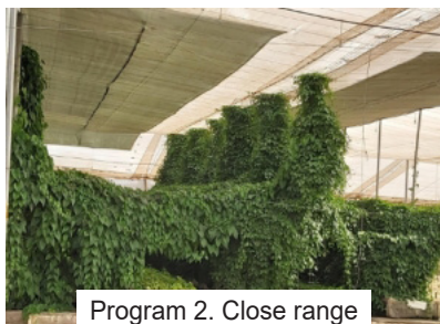
Program 2. Close range