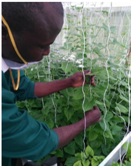
Plate 2.19. Trellising yam growing in HS.