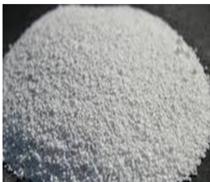
Plate 2.7. Perlite.