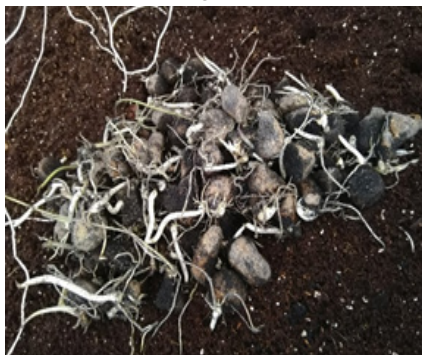
Plate 2.18. Pre-sprouted mini-tubers for planting in HS.