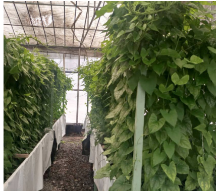
Plate 2.21. Planting in HS.