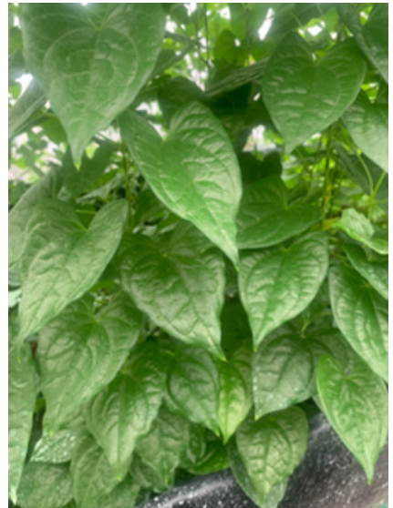
Plate 2.10. Plants growing in rice husk substrate.