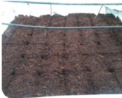
Plate 2.16. HS substrate with holes ready for planting.