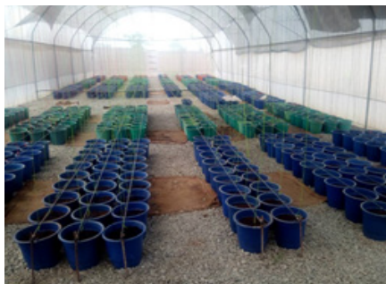
Plate 2.1. Plastic buckets arranged for use in HS.