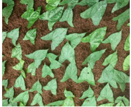
Plate 2.9. Cuttings freshly planted in rice husk.