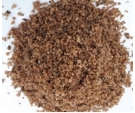
Plate 2.11. Sharp sand from a river.