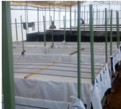
Plate 2.5 HS troughs with installed drip lines.