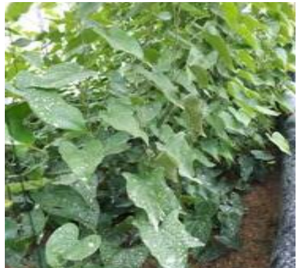
Plate 2.13. Plants growing in sand.