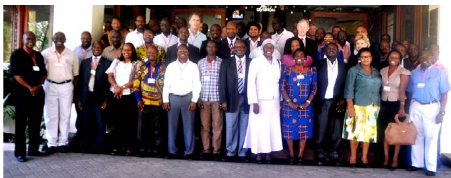
Participants at the CGIAR Site Integration Workshop, Tanzania.