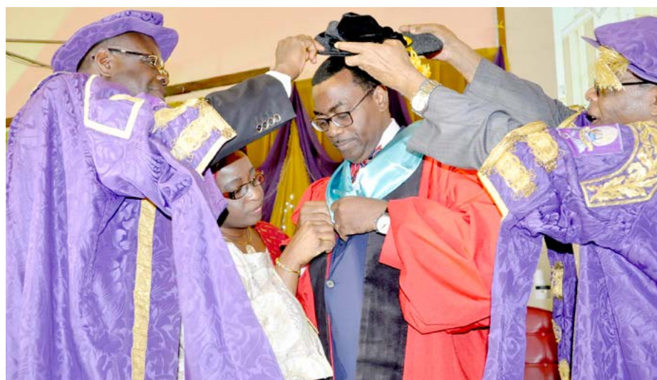
Dr Akinwumi Adesina receiving his cap and gown during the conferment ceremony.

Adesina urged the 2015 graduating PhD students of the University to be of worthy character and to contribute to society's development.