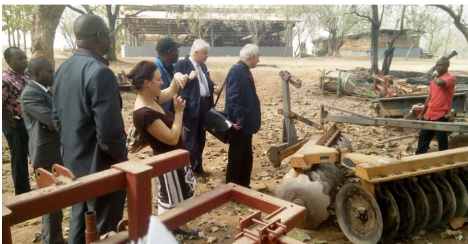
Polish investors went around the IITA-Abuja station.

The visitors expressed satisfaction with the structures at the IITA Station, and requested to use the facilities for the demonstration of their farm machinery. In addition, they invited IITA to pay a learning visit to Poland and offered to help the Institute in deploying world-class technologies on mechanization and commercial agriculture. They also invited IITA scientists to the ground-breaking opening ceremony of their manufacturing plant for agricultural implements,