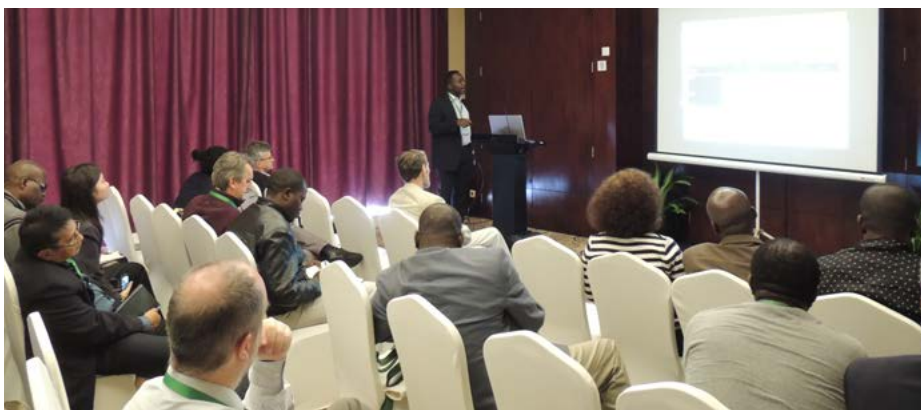
Atser, presenting the findings of the extension study in China.

Atser concluded by calling for the recruitment of young, educated, and upwardly mobile agricultural extension workers in Nigeria, with intensive capacity development to meet the need for effective dissemination of information to farmers on new technologies, varieties, and market opportunities.