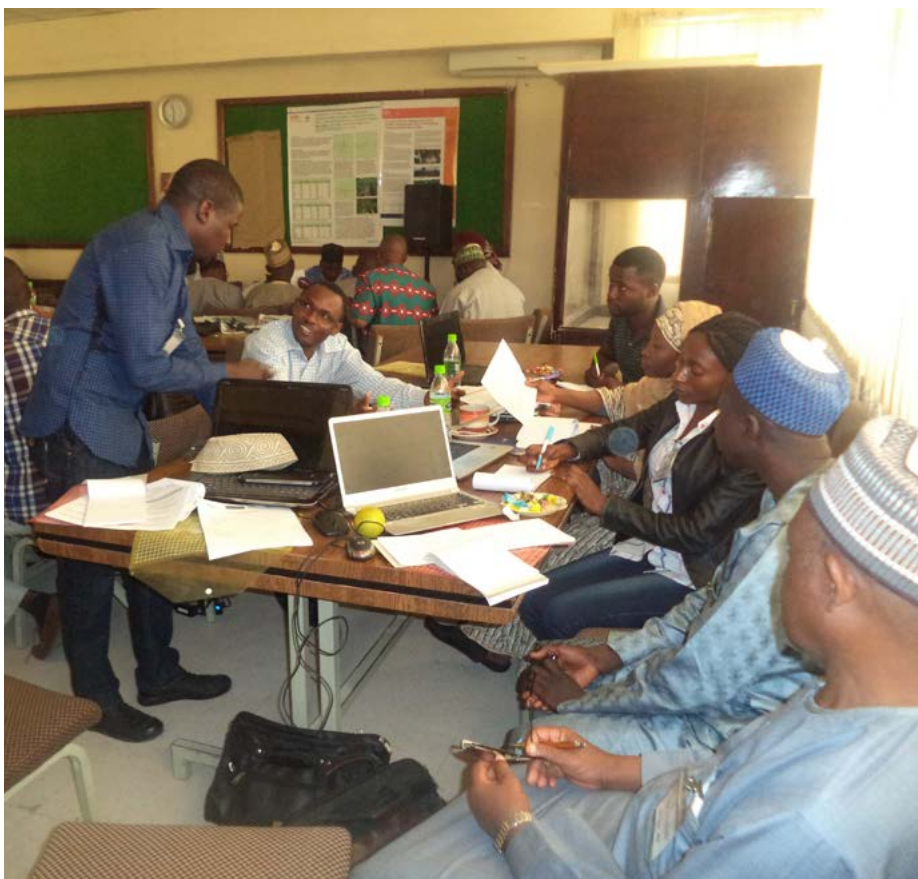
TAMASA training group discussion.

During the workshop, soil fertility constraints and the common practice of blanket fertilizer application by farmers were discussed. The importance of NE