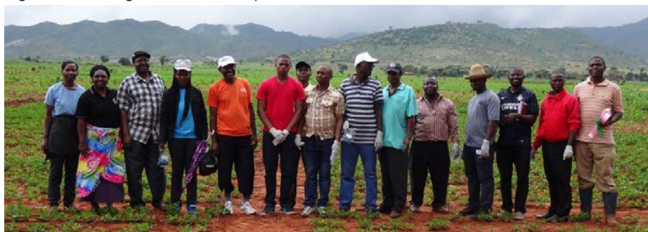
Stakeholders at Kongwa prepare to be shown how to apply the aflasafe in the field.