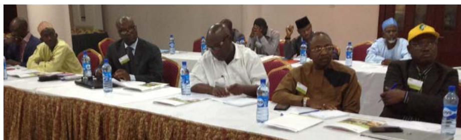
Participants at the soybean workshop.

Soybean scientists from research institutes, soybean farmers, poultry farmers, representatives of seed companies, and other interested stakeholders attended the workshop and brainstormed on the strategies to enhance soybean cultivation. They also deliberated on the way forward for soybean production enhancement.