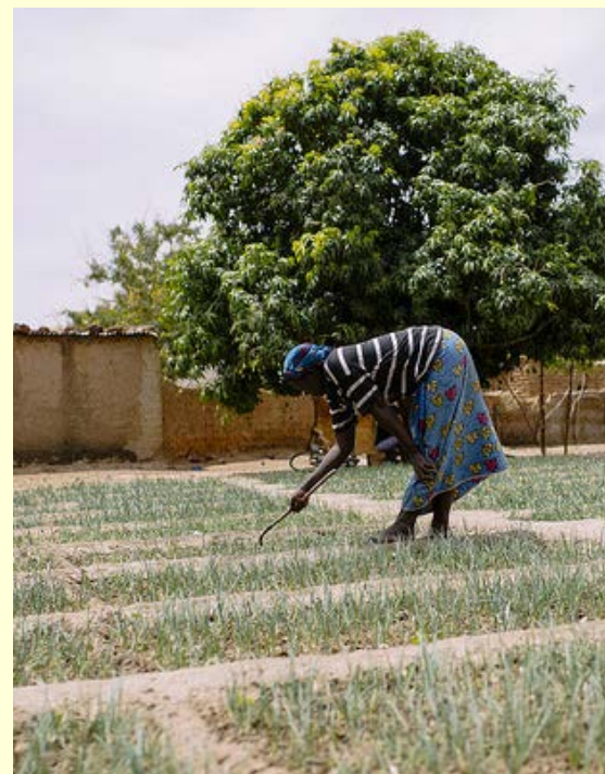
Investment in research has been helping our farmers attain a better quality of life.

The infographic is the latest in Farming First's multi award-winning creative products in support of sustainable agriculture around the world.