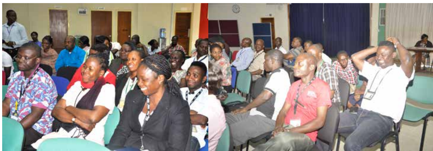
Happy staff members during a seminar at the Conference Center in Ibadan.

He also enjoined all staff to continue to seek the good of IITA and give the Institute their very best.