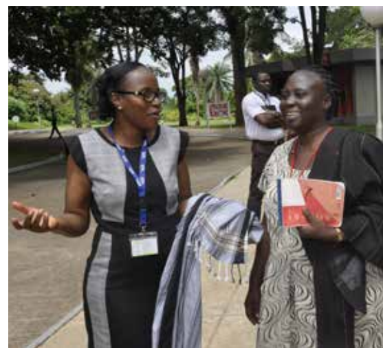
Staff members having a cordial discussion in Ibadan.

Akuffo-Akoto assured members of staff that Management will continue to address these concerns and take appropriate action to address all aspects that are classified in the report as “Medium Range” (where average rating is equal to 4) and all those areas classified as “Concerns” (where average rating is less than 4).