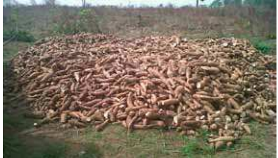
Figure 63. Leaving roots under the sun for too long can lead to weight loss.

the roots from the stump by hand (Fig. 62). This will cause injuries which lead to root rot.