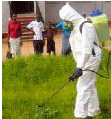
Figure 40. Pre-tillage application.

Chemical method: Herbicides kill or impair weed growth. Herbicides should be applied before land preparation (pre- tillage) (Fig. 40); immediately after land preparation (pre-emergence) (Fig. 41), and 4–8 MAP (post-emergence) (Fig. 42).