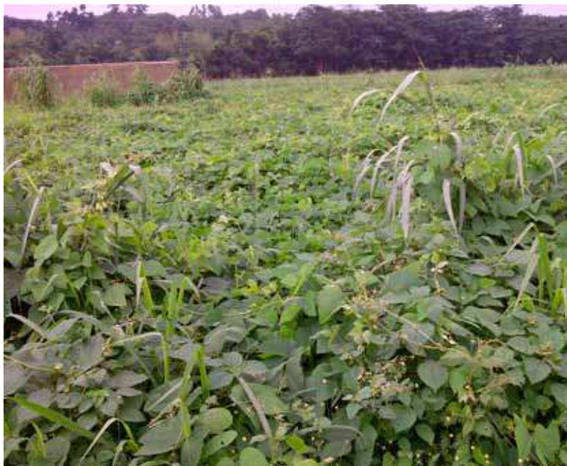
Figure 6. Mucuna fallow for soil replenishment (improvement).