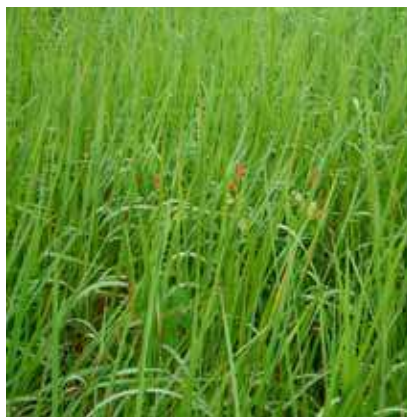
Figure 35. Imperata cylindrica .