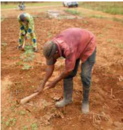
Figure 37. Hand weeding.