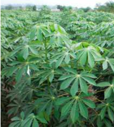
Figure 2. Luxuriant cassava crop supported by fertile soil.