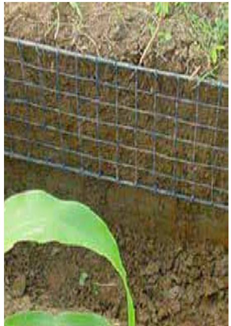
Figure 1. A typical soil pit with rich topsoil.