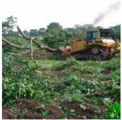
Figure 44. Monkey winch felling trees.