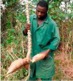
Figure 62. A bad handling practice.