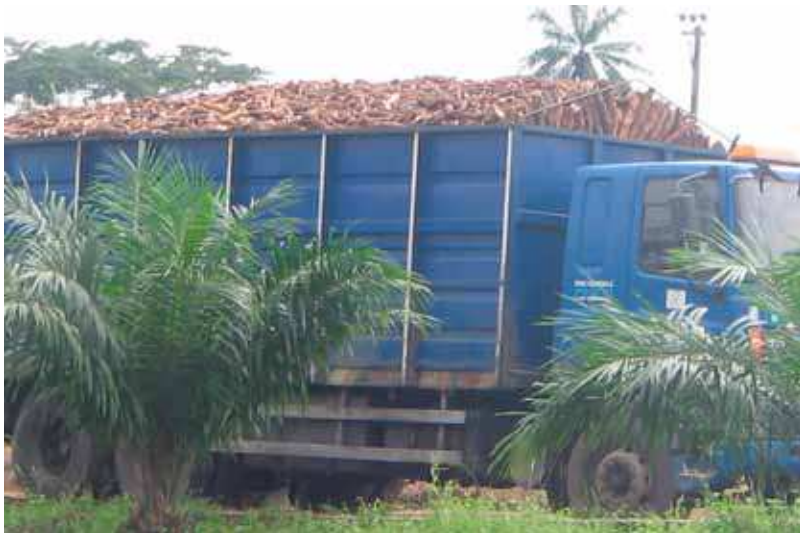
Figure 66. Truck offloading roots at MATNA.

have the capacity to process hundreds of tonnes of cassava fresh roots/day. They operate integrated automated systems that allow them to accept fresh roots through motorized conveyors and release the end products (starch or glucose syrup) after necessary transformations have taken place. Thus, they have the potential to make bulk purchases of cassava roots, arrange transport and logistics for conveying roots, weigh roots on getting to the factories, and conduct relevant tests to ensure that farmers are not shortchanged (Figs 66, 67, and 68).