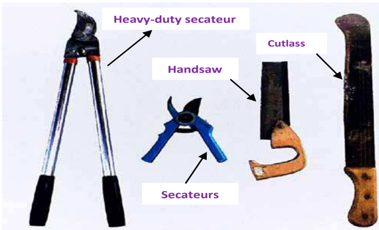
Figure 21. Sharp tools for cutting stem.