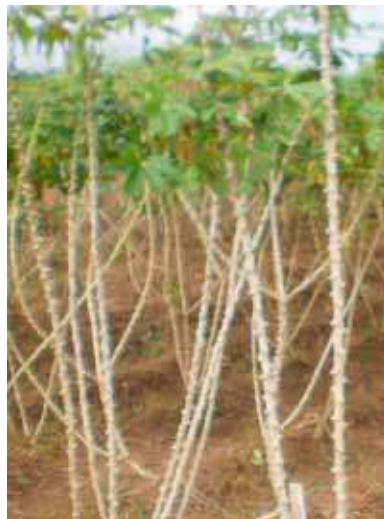
Figure 19. Mature cassava plants.