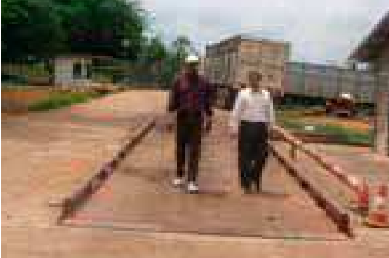
Figure 67. Weigh bridge at NSM.