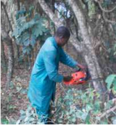
Figure 45. Chain saw.