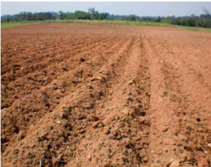
Figure 8. Example of good ridges.