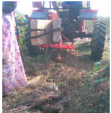
Figure 55. Mechanical harvester.