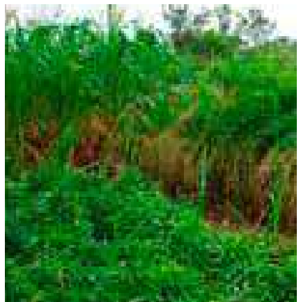
Figure 17. Live mulch.