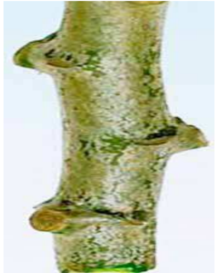
Figure 33. 3-node piece of stem.