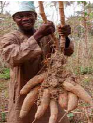
Figure 56. Cassava harvested during dry weather.