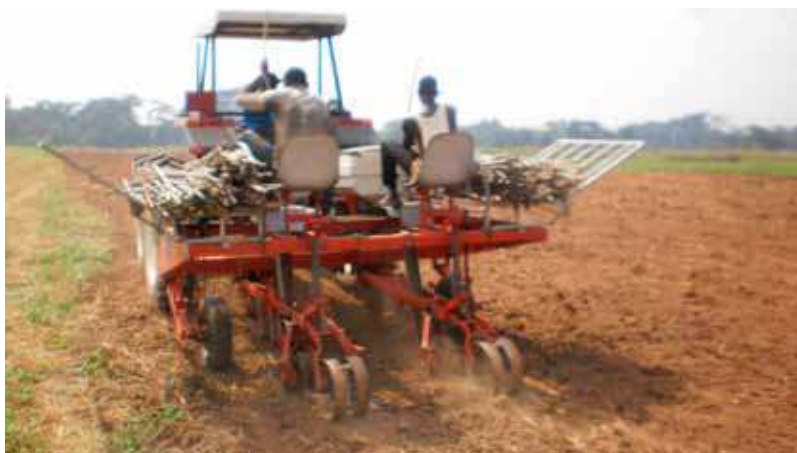
Figure 49. A mechanical planter.