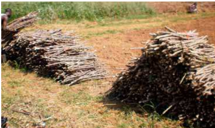
Figure 10. Healthy stems for planting.