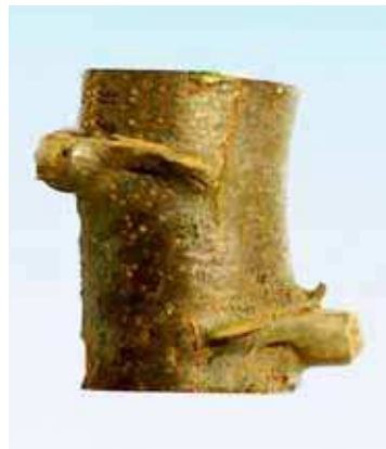
Figure 26. 2-node piece of stem.