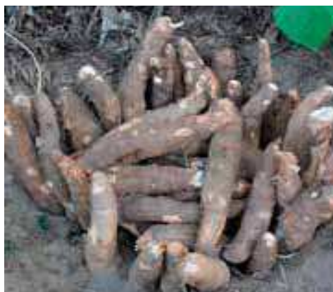
Figure 65. Cassava roots arranged in a trench.