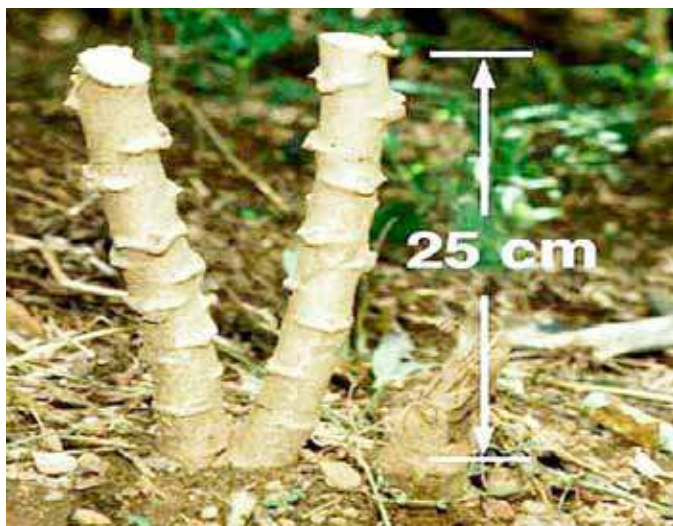
Figure 31. Cutting heights.