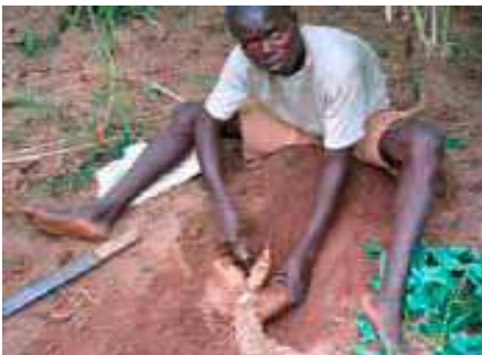
Figure 60. Man carefully digging soil to harvest cassava roots.