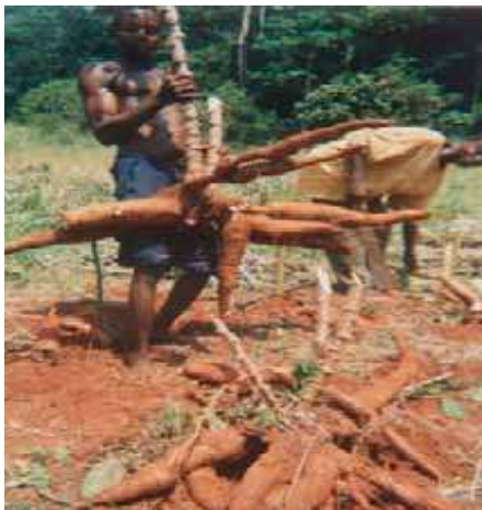
Figure 54. Manual harvesting.