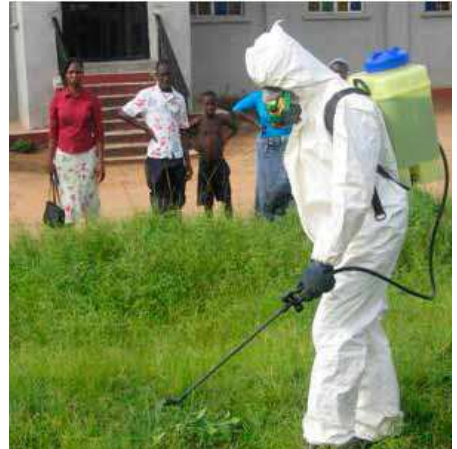
Figure 53. A knapsack sprayer.