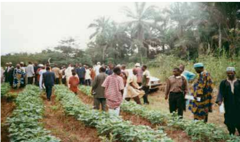
Figure 14. Soybean in rotation.