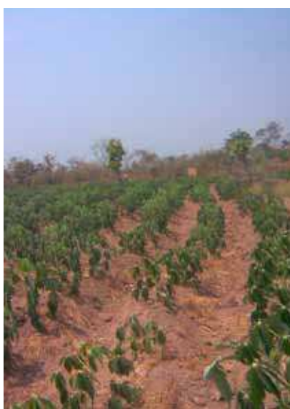
Figure 12. 1 m x 1 m plant spacing.