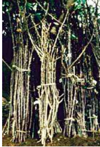
Figure 20. Stems under shade.