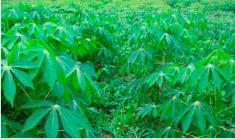
Figure 13. Cassava intercrop with melon.