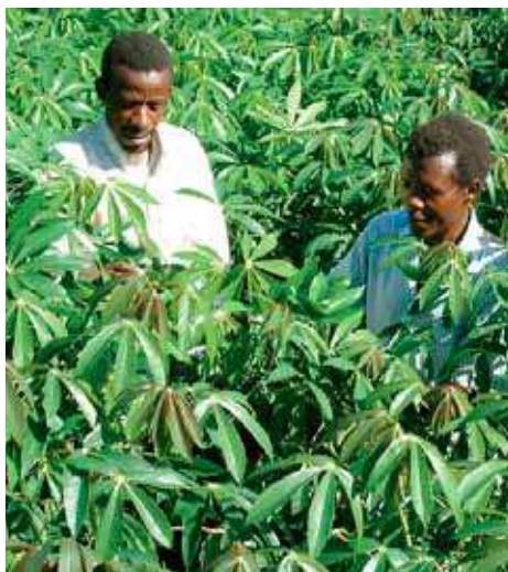
Figure 18. Good growth of cassava.