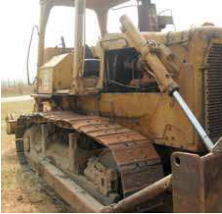
Figure 43. Bulldozer in operation.