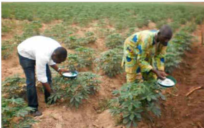
Figure 4. Ring application of fertilizer on young cassava plants.