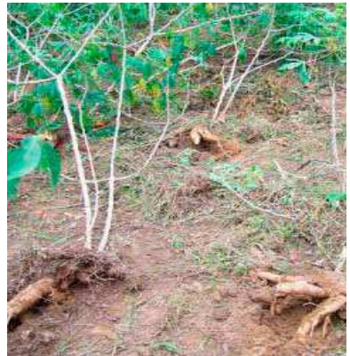
Figure 57. Cassava harvested in wet soil.