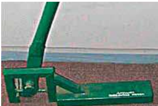
Figure 64. A cassava lifter.