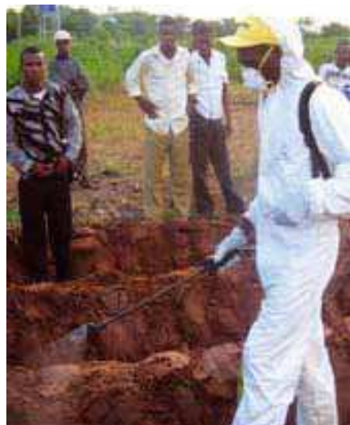
Figure 41. Pre-emergence application.