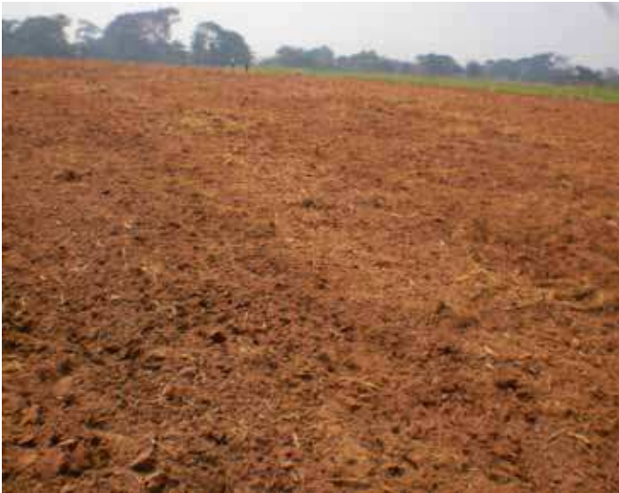
Figure 7. Example of a good soil.