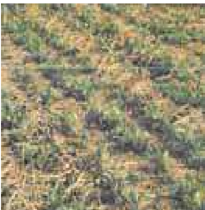
Figure 16. Dead mulch of straw between rows.

Cover crops such as Mucuna , Centrosema , and Aeschynomene , when used as live mulch are usually incorporated into the soil before the crop is planted.