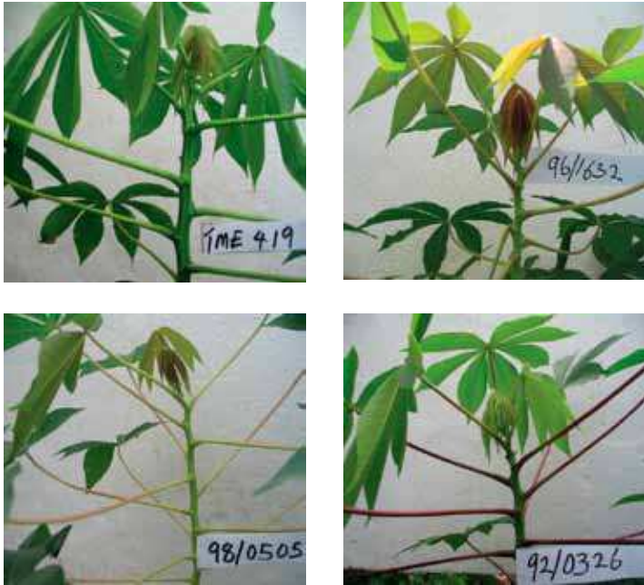
Figure 9. Selected examples of improved varieties.