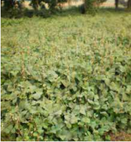
Figure 15. Mucuna as fallow.