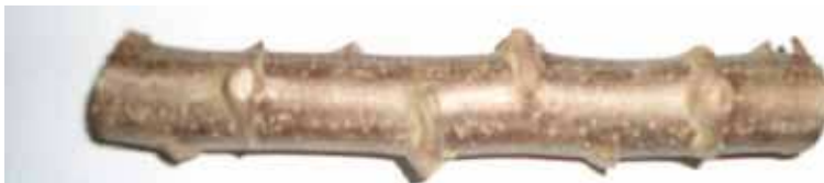
Figure 22. 5-7 node piec of stem.