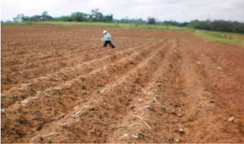
Figure 25. Planting on ridges (crest).