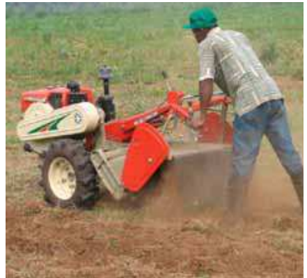
Figure 48. A power tiller.