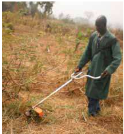
Figure 38. Mechanical weeding.