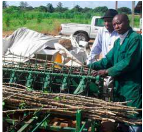
Figure 51. Cutting of stem with chain saw.