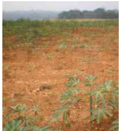
Figure 3. Stunted cassava crop growing on poor soil.