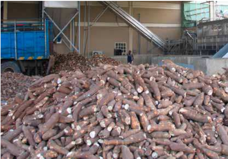
Figure 68. Offloaded roots ready for processing at EKHA Agro.

opportunity of buying all its cassava starch locally, thereby, creating job opportunities and income for farmers. The farmers are being encouraged to identify and benefit from this golden opportunity.