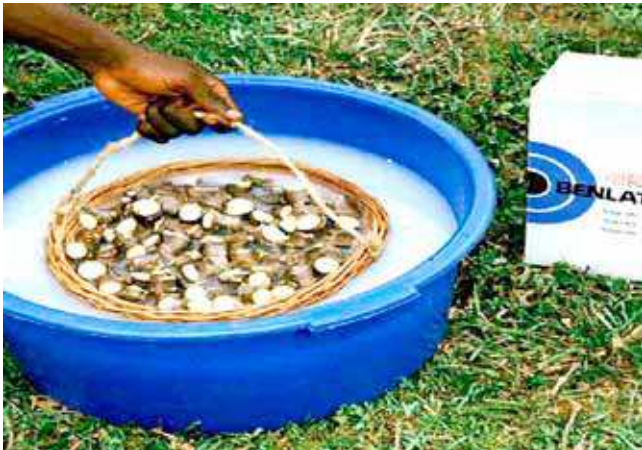
Figure 27. Stakes in insecticide.