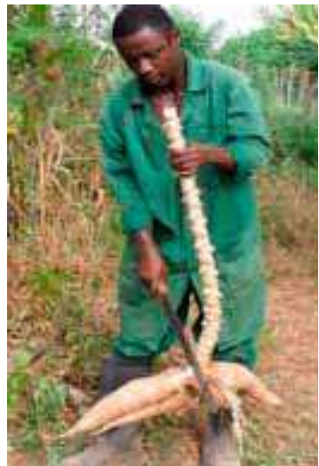
Figure 61. A good handling practice.