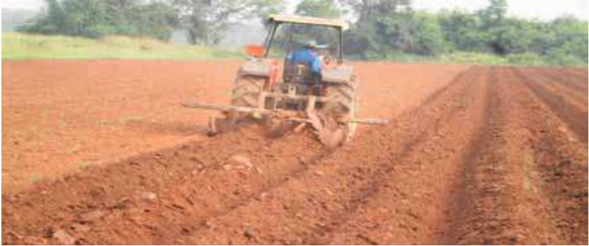
Figure 39. Good land preparation (Tillage).