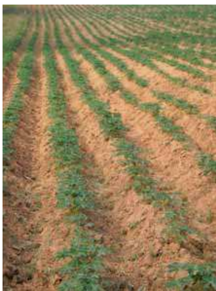
Figure 11. 1 m × 0.8 m plant spacing.