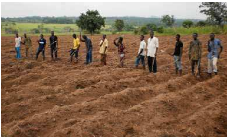
Figure 24. Stand-by for planting.