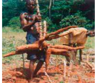
Figure 59. Lifting cassava roots from the soil.