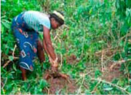
Figure 58. Woman pulling cassava gently from the soil.