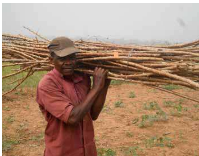
Figure 32. Handle harvested stems carefully.