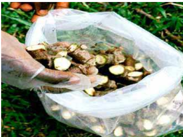
Figure 28. Stakes in polybags.