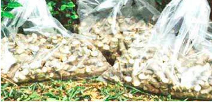
Figure 29. Bags under a shady tree