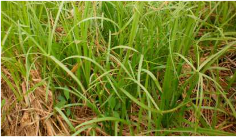
Figure 36. Cyperus rotundus .