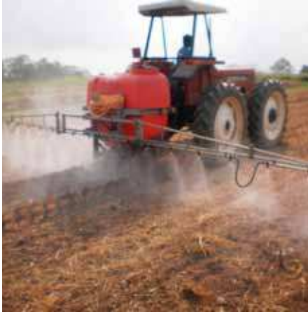
Figure 52. A boom sprayer.