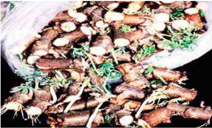
Figure 30. Sprouted stakes.