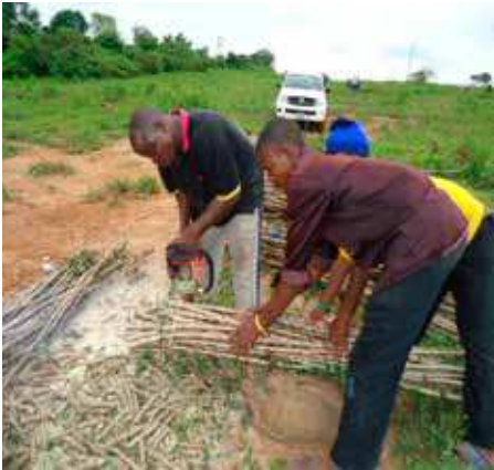
Figure 50. A stem cutting machine.