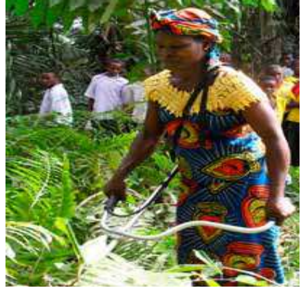
Figure 46. Woman farmer using brush-cutter.