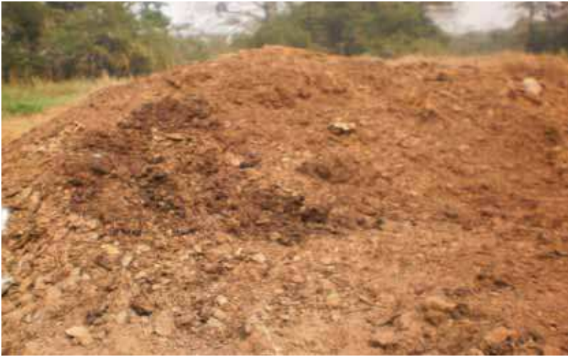
Figure 5. Pile of manure usually available in many homes.