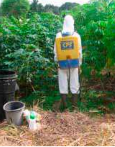
Figure 42. Post-emergence application.