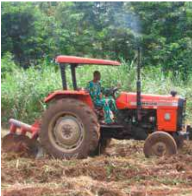
Figure 47. A tractor-mounted plough.