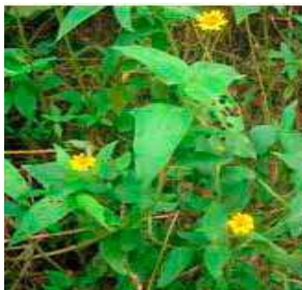
Figure 34. Aspilia africana .

Sedges – Cyperus rotundus (Fig. 36), Cyperus esculentus , Mariscus alternifolius , and Mariscus flabelliformis