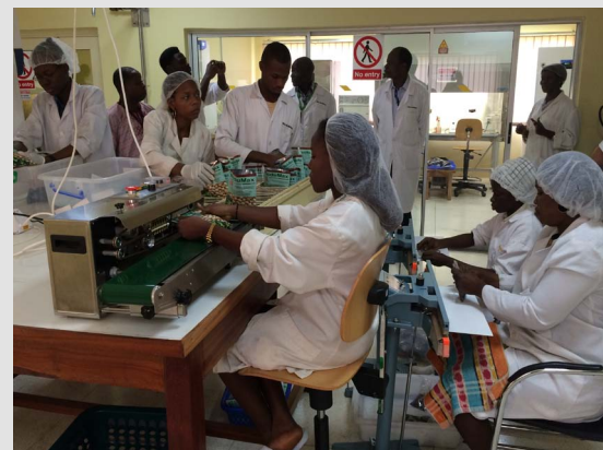
IITA Business Incubation Platform.