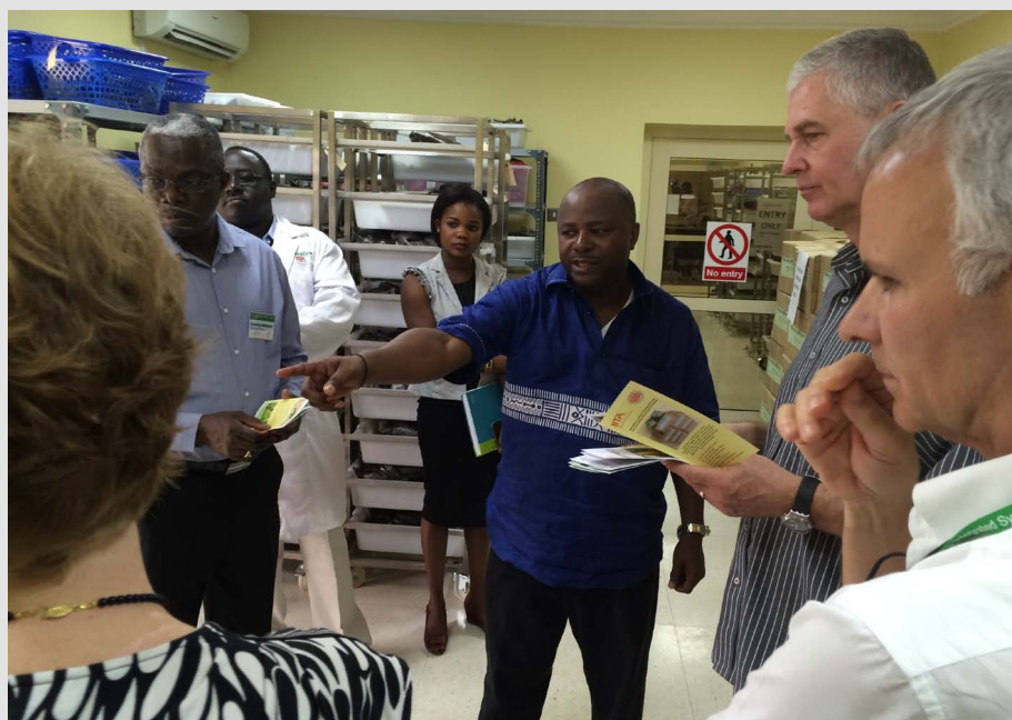
DG Nteranya Sanginga explaining about the soybean inoculant Nodumax, IITA Business Incubation Platform.

The goal of the BIP aflasafe plant and laboratories is to develop cheaper, more effective formulations and manufacturing methods for a product which is combating the deadly aflatoxins found in major staple crops in Africa. The plant is compatible with African farming and business models and can easily be transferred to the private sector. The aflasafe plant is also busy manufacturing the urgently needed product