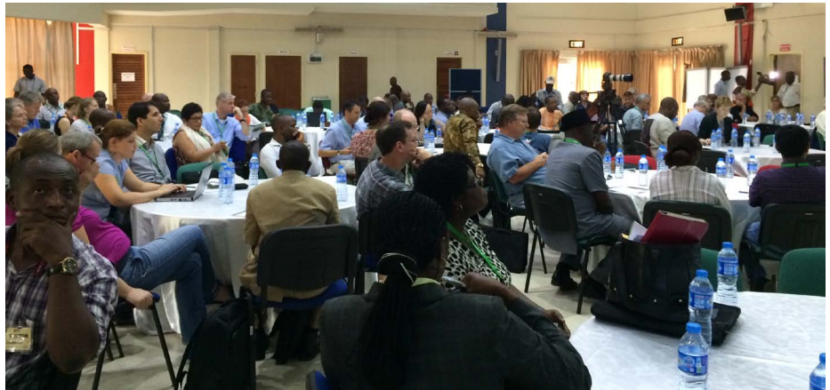
Participants at the opening program of the Systems Research Conference.

Aquatic Agricultural Systems (AAS) and the CGIAR Research Program on Dryland Systems (Drylands).