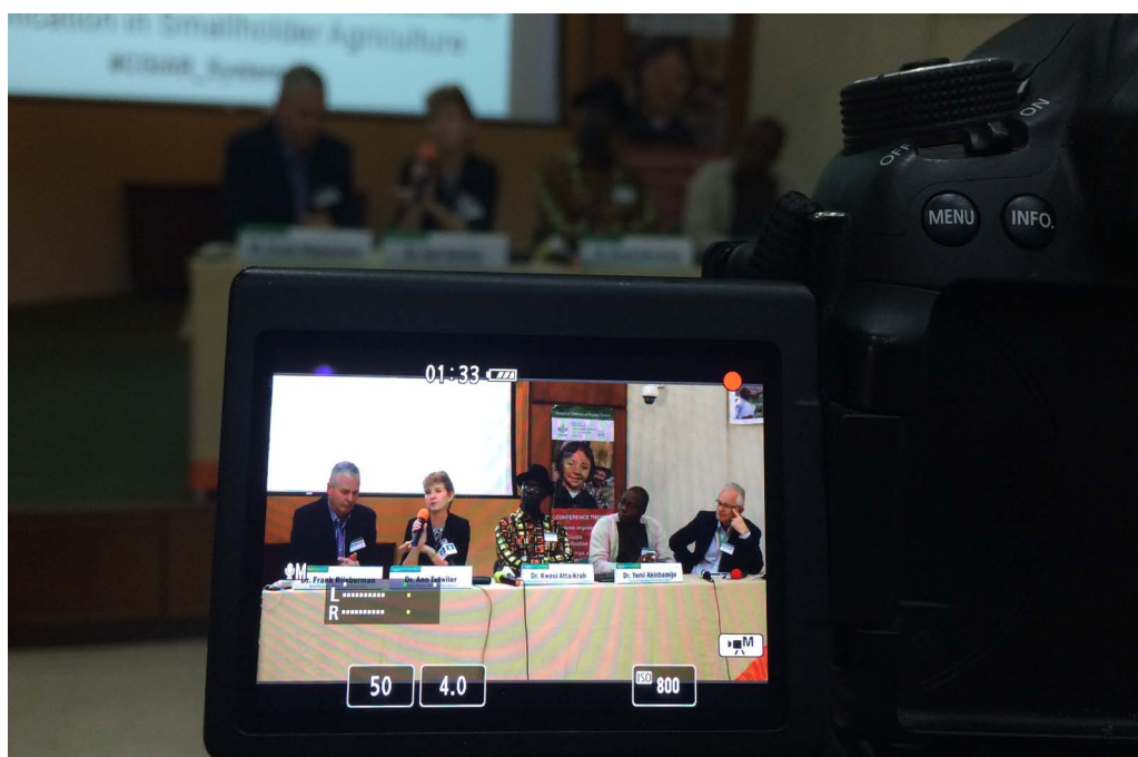
Keynote speakers during the media briefing.