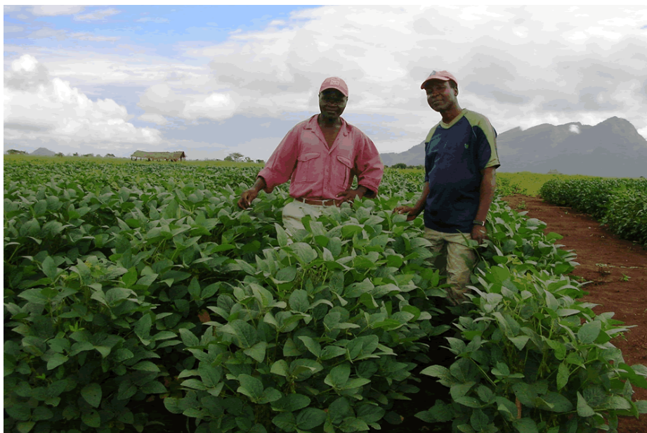
MIRACLE helps farm families affected by AIDS to get back into mainstream society through productive agriculture.