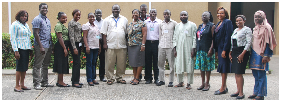
IARSAF organizes training for both members and nonmembers.

Participants thanked the course organizers and expressed their appreciation to the facilitator for sharing knowledge and requested more training on other statistical packages. They also requested that such a training be well publicized to give room for more interested participants.