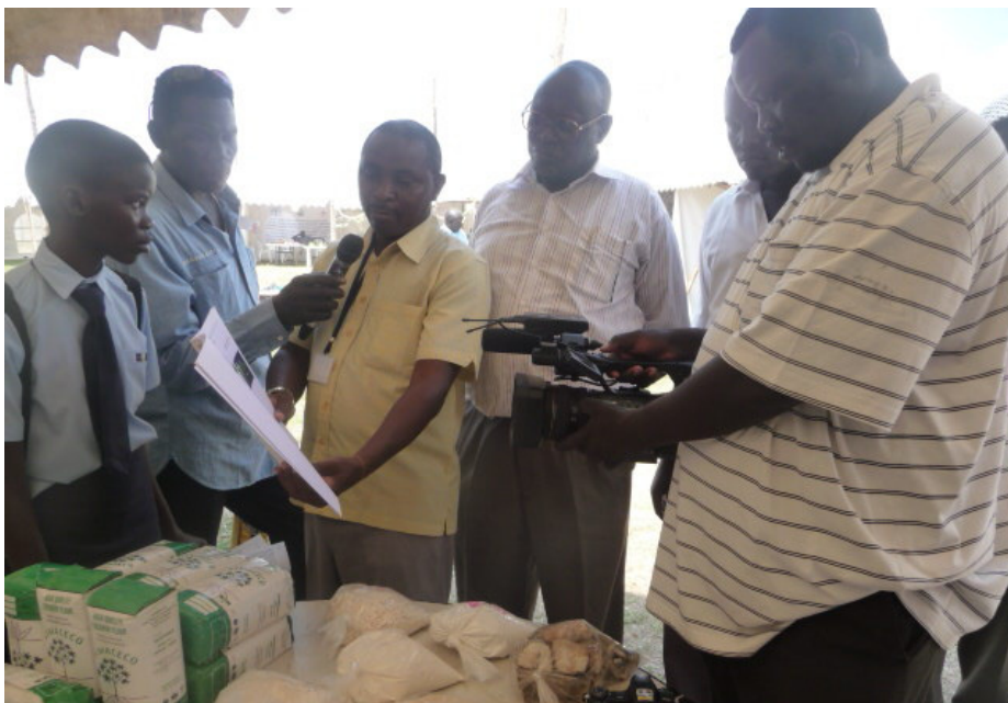
The IITA booth drew crowds of participants during the agriculture fair.

The agriculture fair and conference were an important platform for IITA to make its presence felt and build inroads for future partnerships and collaboration with the government, NGOs, and other institutions in the Republic of South Sudan.