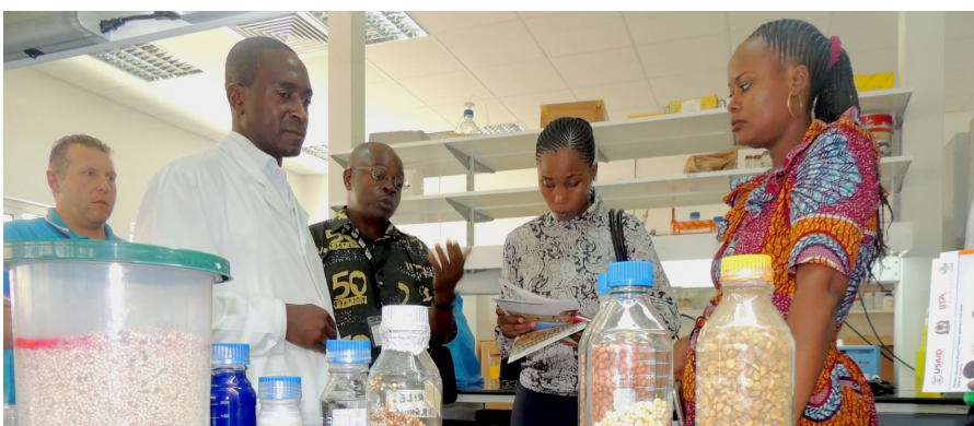
IITA scientists take guest on a tour around the lab.

The team was briefed on IITA's research activities in the country and they also toured the various facilities including the Food, Molecular, Soil, and Pathology laboratories.