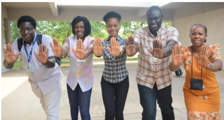
IITA men celebrating with women in pressing for progress