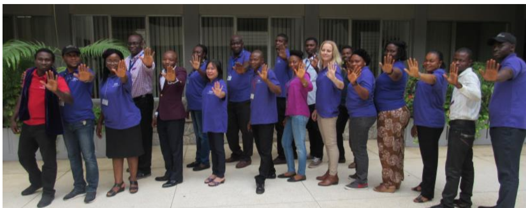
The IITA-HR team in Ibadan, in a #pressforprogress posture.