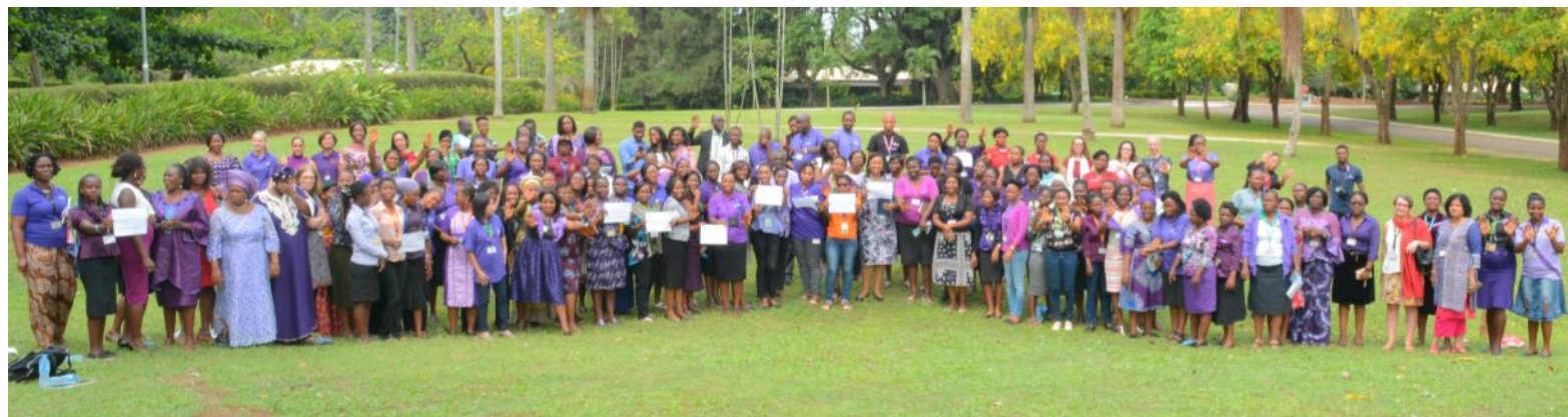
A large representation of IITA women in Ibadan

IITA women across the hubs joined millions of women all over the world to celebrate International Women's Day on 8 March with the theme: #PressforProgress. The day is a globally recognized day to celebrate the social, economic, cultural, and political achievements of women.