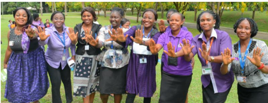
Other IITA women in Ibadan in high spirits, joined in the celebration to #pressforprogress.