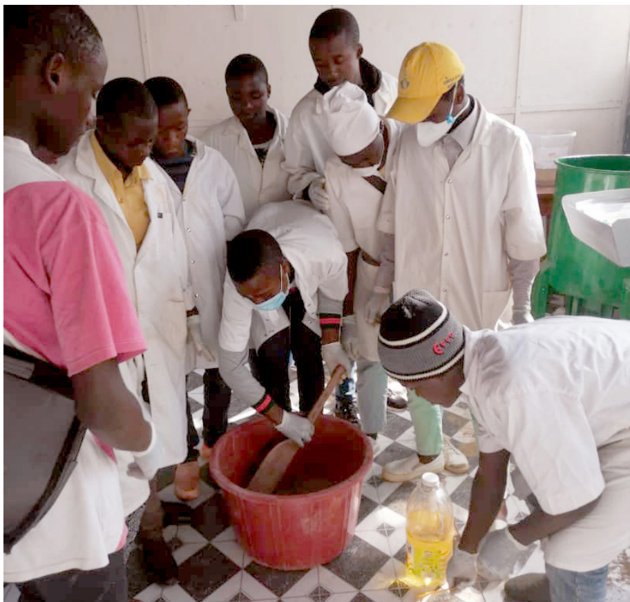
A cross-section of students learning how to prepare fish feed