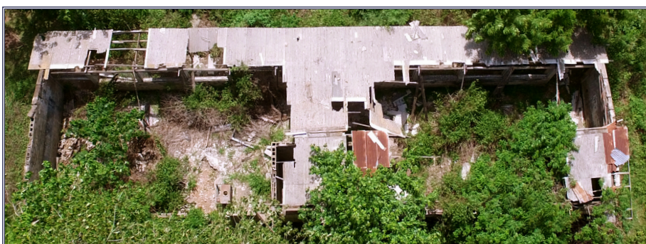
The abandoned introductory technology workshop abandoned 30 years ago, to be renovated into an agribusiness training center