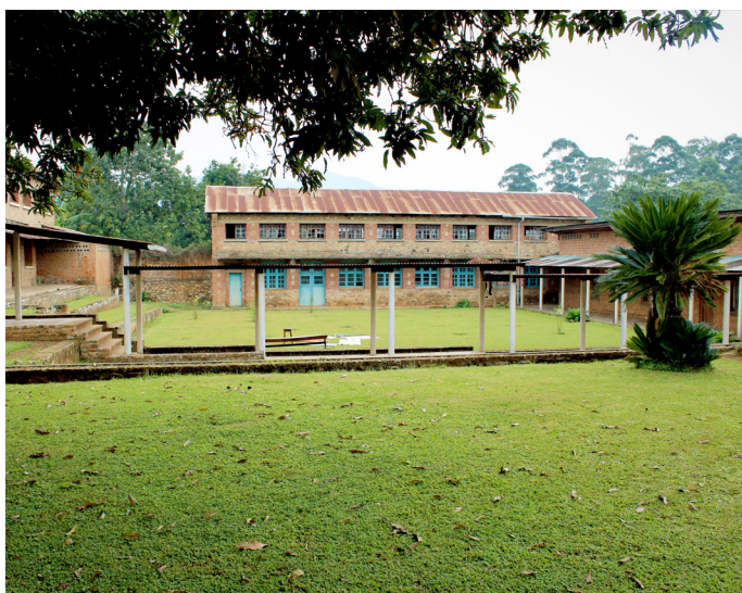
The school wearing a new look just before the new 2019/2020 academic session