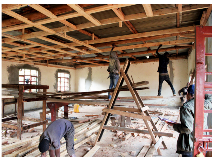
Pictures taken on July 27: On-going construction which will be completed before September