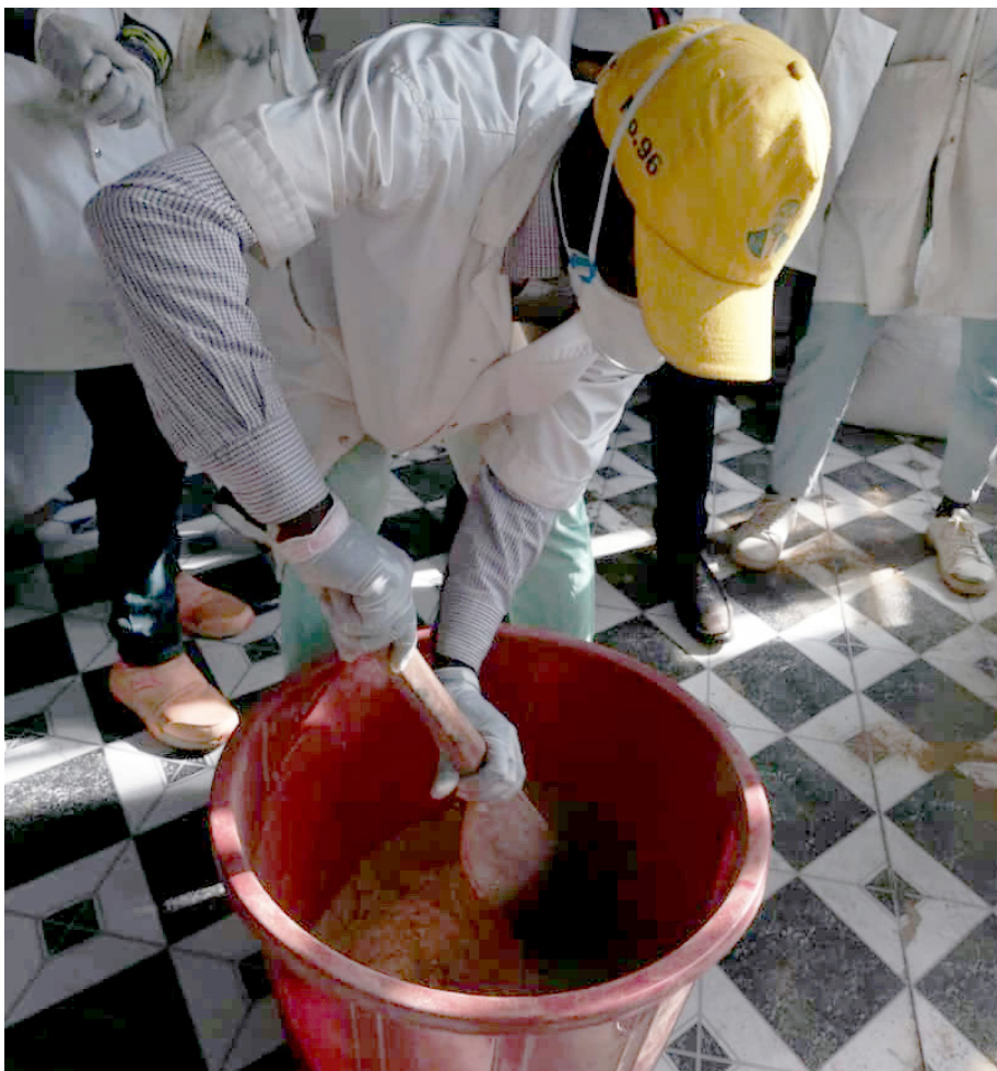
One of the students mixing the fish feed after being taught

The STEP team in DR Congo has concluded its first intensive agribusiness training workshop for high school students. STEP has received a growing interest from high school students since its introduction into schools' activities in the DRC.