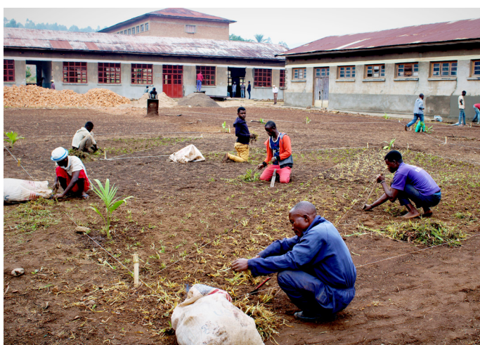
The students taking part in the beautification of the school