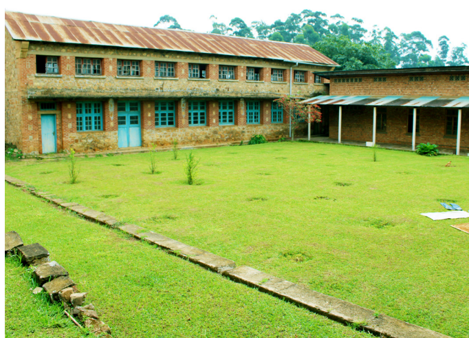
The new school environment