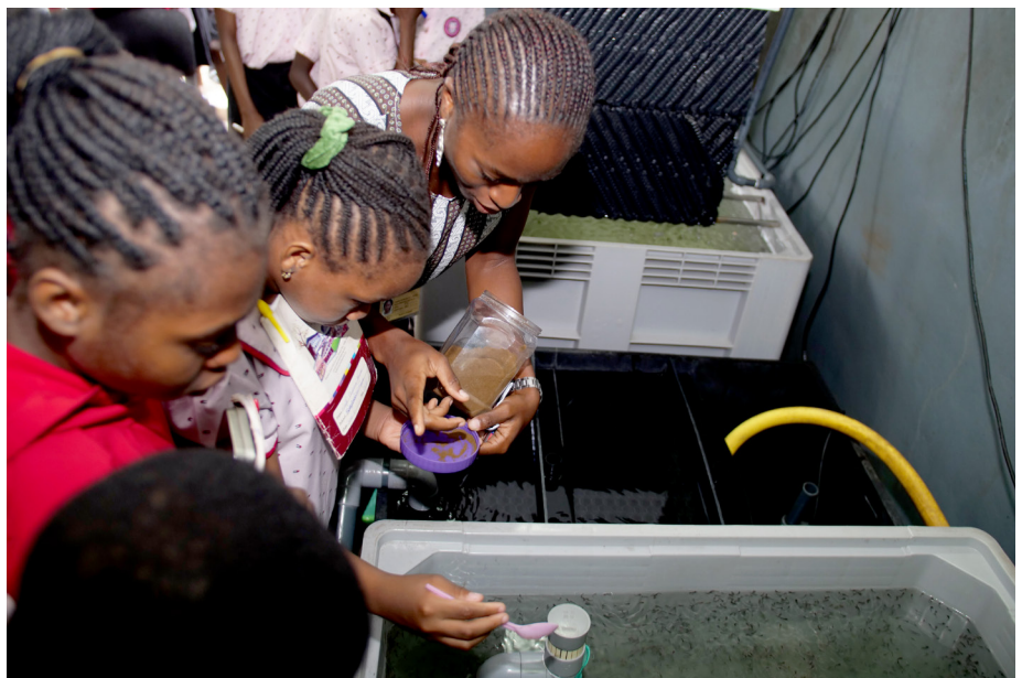
The students learning how to feed catfish fingerlings at the hatchery facilities of IITA Youth Agripreneurs