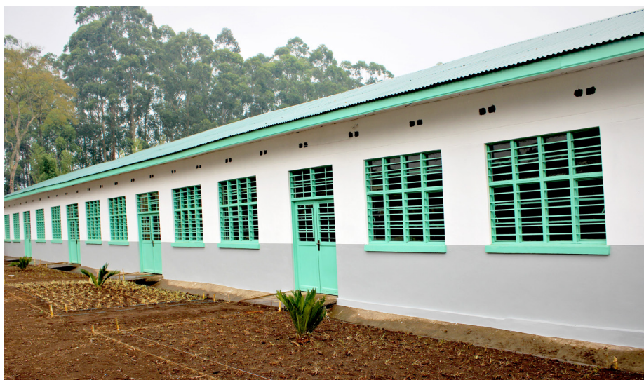
The newly renovated building with five rooms