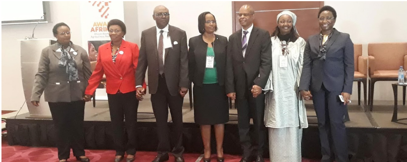
A group photograph of delegates at the end of the trade fair

Advocacy is a major component in the creation of an enabling environment for any development project and it takes many forms, such as participation, presentation and exhibitions in a series of youth fora. The aim of the African Women Agribusiness Network (AWAN-Afrika) Continental Conference and B2B fair was to connect women and youth in agribusiness to the African Continental Free Trade Area (AfCFTA) and the global market.