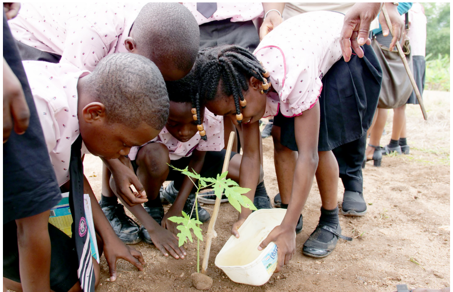
The students planting pawpaw at IITA Women's Field

// as their class teacher in school, some of them told me that they wanted to be engineers and doctors. After the STEP training and the field tour today at IITA, they suddenly changed and they now tell me they want to become farmers! That means they did not know the potentials in farming. Farming is actually the bedrock of all occupations or professions which we have actually discovered. There's no kid who has not taken a meal today, and that shows they have all patronized a farmer. This means that farming is very essential, and it is very good that our young ones are catching the vision of going into it right from the early age", he said. //