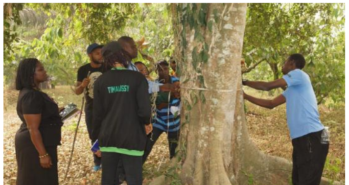
Partner technicians in the field measuring shade cover and the DBH of the tree