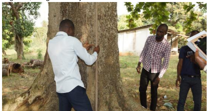
Partner technicians in the field measuring shade cover and the DBH of the tree