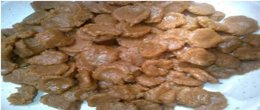
Molded groundnut cake ready for frying.