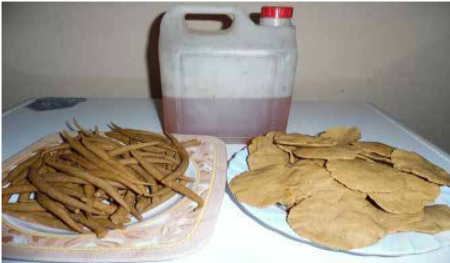
Processed groundnut cake and oil.