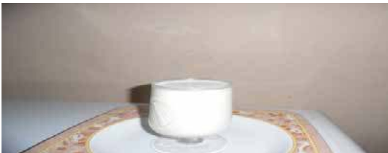
Processed Soybean Milk.