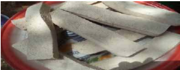
Soybean Cheese (basic product)