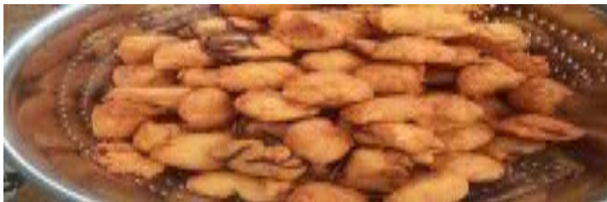
Soybean/cowpea cake (Akara)