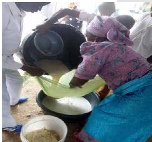
Community and school cereal legume recipe development demonstrations sessions.