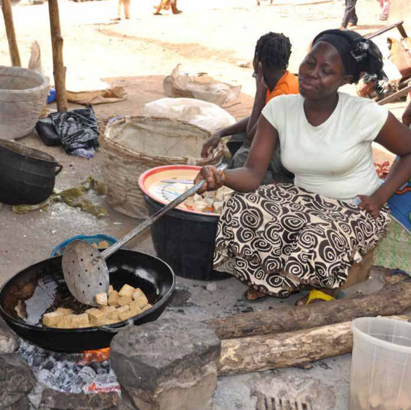
Nigerian woman processing soybean cakes