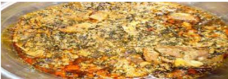
Soybean Vegetable Soup.