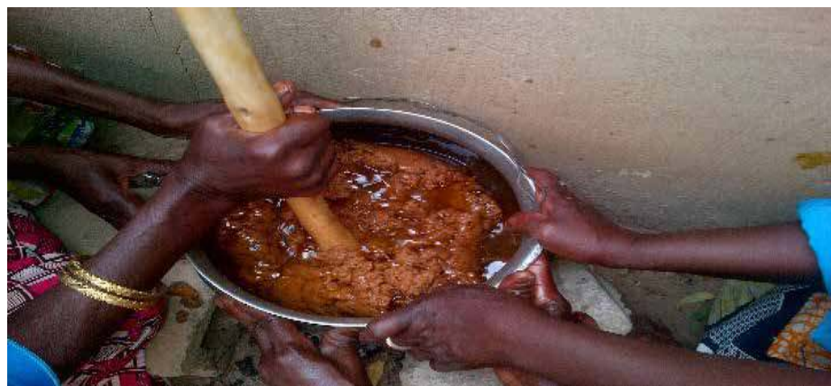
Manual processing of groundnut oil.