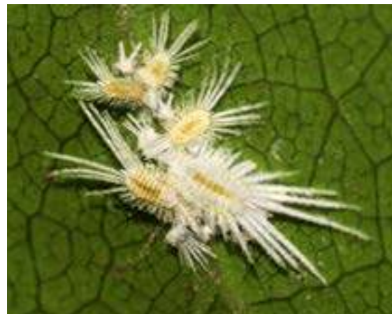
Mango mealybug, Rastrococcus invadens .

At global level, the challenge of invasive species is recognised as significant and the United Nations (UN) declared 2011–2020 as the Decade on Biodiversity. Subsequent to the commitment, global frameworks such as the Sustainable Development Goals (SDGs), Convention on Biological Diversity (CBD) through its Aichi Biodiversity Targets made provisions for needed actions to among others “Encourage Parties to promote the United Nations Decade on Biodiversity in ways appropriate to