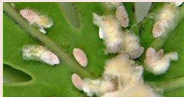
Cassava mealybug, Phenacoccus manihoti .

Cassava mealybug ( Phenacoccus manihoti ) is a scale insect species, which originated from south America and was accidentally introduced in Africa in early 1970's. Within 15 years of its discovery, it had invaded most of West and Central Africa and was spreading to the East. By the 1980s the mealybug was a major pest. IITA