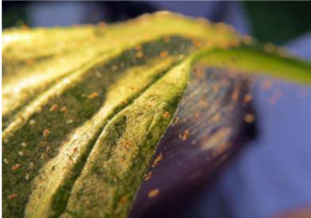
Red tomato spider mite, Tetranychus evansi .