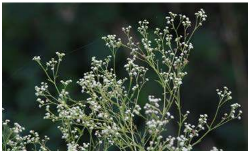
Famine weed, Parthenium hysterophorus .