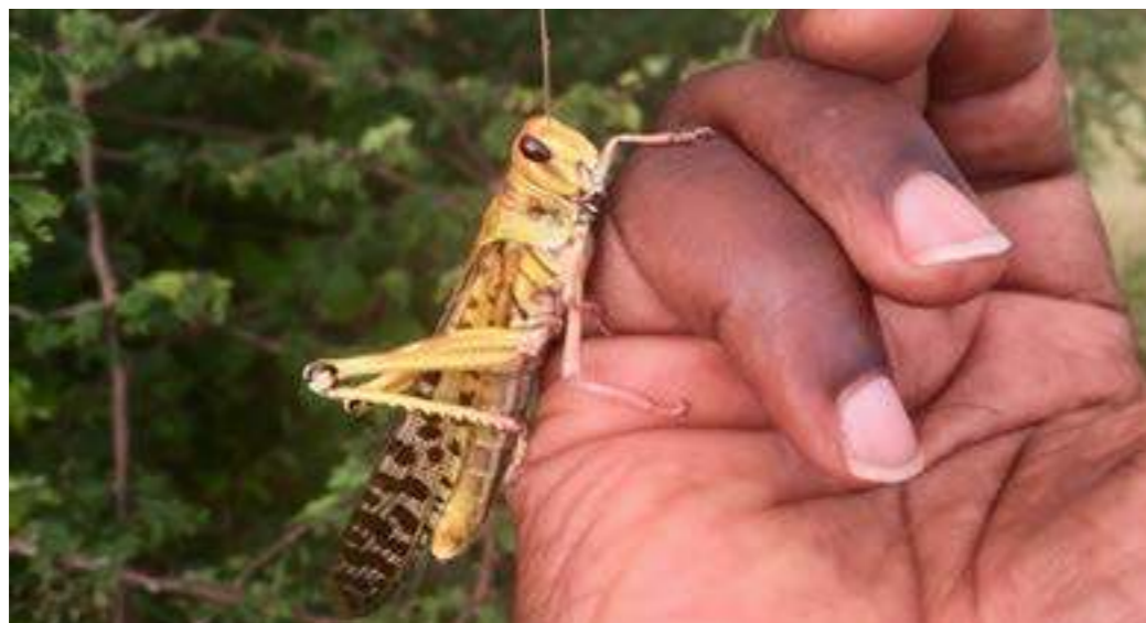
Desert locust, Schistocerca gregaria .