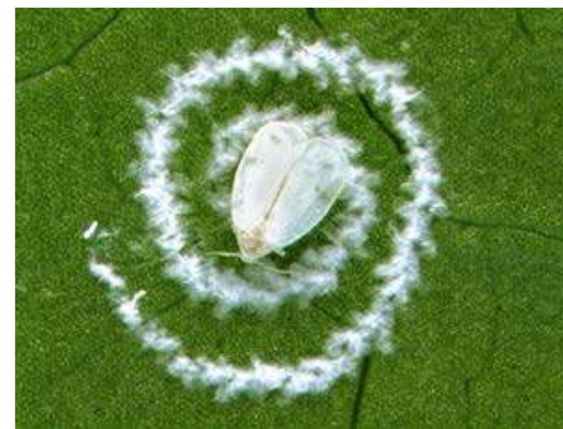
Spiraling whitefly, Aleurodicus dispersus .

The literature review was conducted in order to ensure that the strategy is developed within the context and magnitude of the challenge of invasive species in Africa. Lastly, the questionnaire was used to secure a wider reach to various stakeholders as well as to corroborate plus triangulate inputs from the literature reviews and consultative meetings.