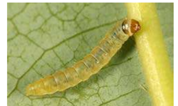
Tomato leafminer, Tuta absoluta larva.

Drawing from the stakeholder consensus (in Section 1.2), the scope of this Strategy is to