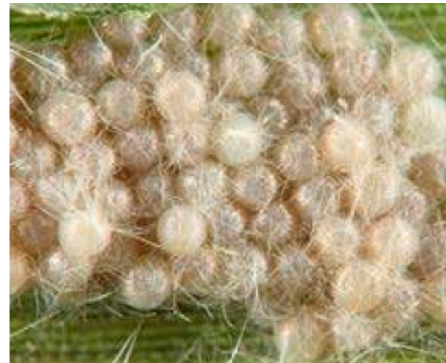
Fall armyworm, Spodoptera frugiperda eggs.

Over half of the world's food comes from just three crops - rice, wheat and maize. Centre for Agriculture and Biosciences International (CABI) estimates that these three crops alone suffer annual yield losses of up to 16% (i.e. US$96,000 million of lost production) due to invasive species (CABI, 2019) 1 . Invasion of fall armyworm in 12 African countries is estimated to cause annual yield loss of 4.1 to 17.7 million tons of maize crop alone. It is estimated that 480,000 invasive species have been introduced to different ecosystems globally. Unfortunately, their geographic spread and impact is growing due to climate change, trade and tourism. There has been an unprecedented rate of new introductions in recent years, as well as a rapid expansion of existing biological invasions. The impacts of invasive species on biodiversity are well established except in Africa. Some of the impacts include decreased abundance and diversity of native species in invaded sites resulting in changes in communities.