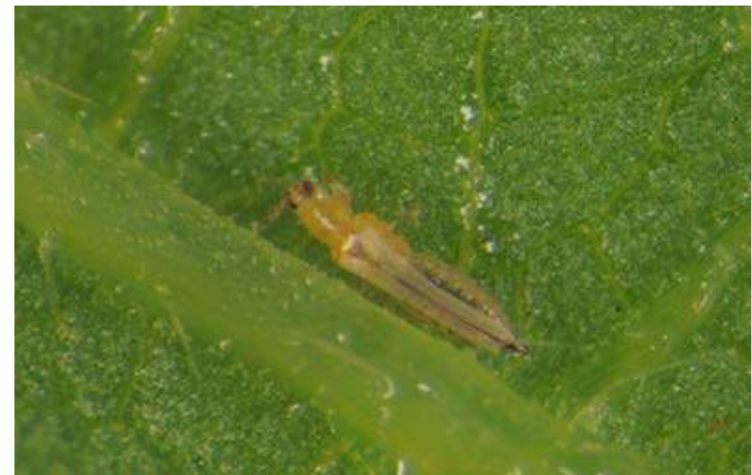
Western flower thrips, Frankliniella occidentalis .

Ultimately, implementation of this strategy should support Africa's effort to not only achieve sustainable functioning of biodiversity and ecosystems at continental level but also in the long-term reduce significantly the financial resources that have otherwise been spent through ad hoc and reactive approaches geared towards ineffective prevention, exclusion and management of invasive species.