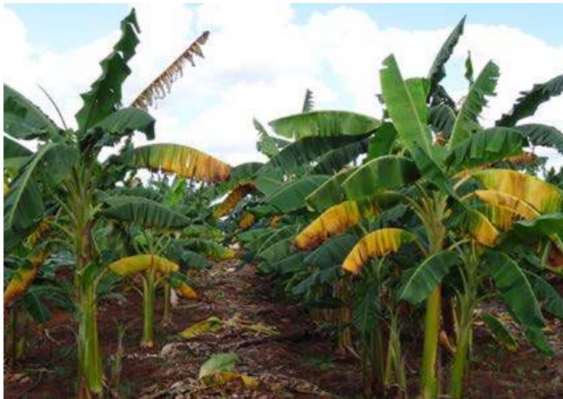
Fusarium wilt or Panama disease, Fusarium oxysporum f. sp. ubense (Tropical Race 4 - TR4).