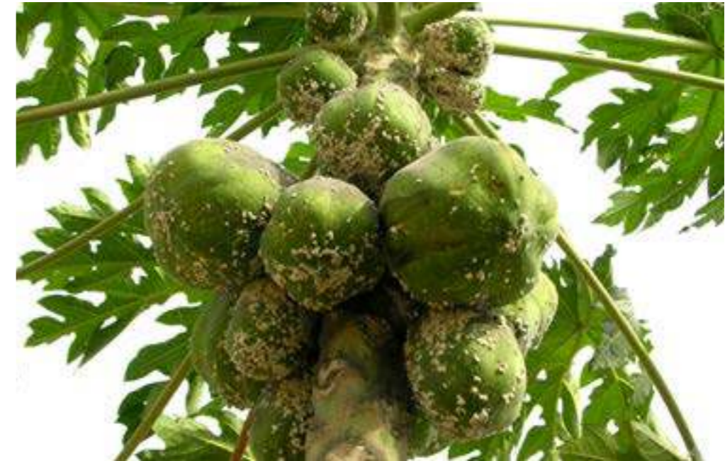
Papaya mealybug, Paracoccus marginatus.

serve as the focal implementation units for most of the activities highlighted in the strategy. The member states are signatories to global frameworks and initiatives and are thus obligated to comply to minimum standards and provisions. National Plant Protection Organizations and the AU should serve as an aggregator for Member States engagements on invasive species and relay such information (progress and data) to relevant global institutions such as the CBD secretariat.