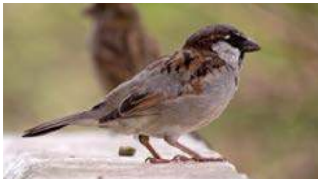
The house sparrow ( Passer domesticus ).

fire, climate) or management regime, but are enhanced or accelerated by the invasion. Examples of invasive species in different taxa (including plants, tunicates, annelids, molluscs, crustaceans, arachnids, insects, fish, amphibians, reptiles, birds and mammals) that have been