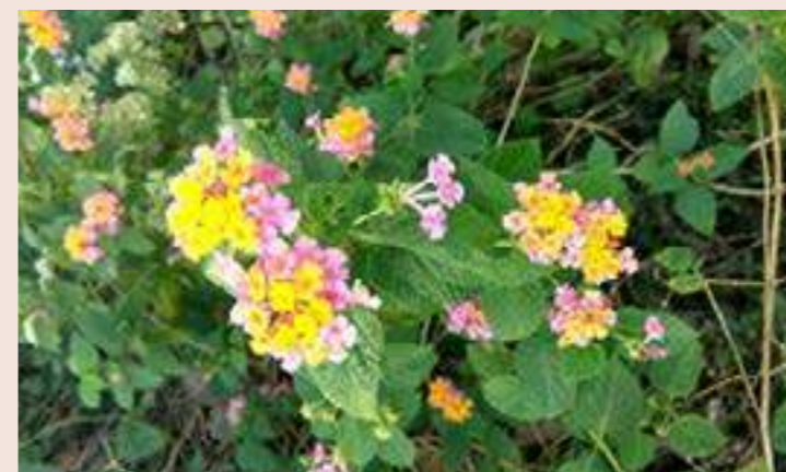
Lantana or Shrub verbena, Lantana camara .

Lantana camara: A member of the verbena family (Verbenaceae), lantana (as commonly known as wild-sage, big-sage, white-sage or tickberry) has spread across wide portions of Africa. Although it is a native to Latin America, it is now widely spread as a notorious weed across different continents. Cost-benefit analyses of use of biocontrol in both South Africa and Australia showed consistently high returns on investment. In South Africa, a benefit–cost ratio of 35:1 has been achieved on biocontrol programmes using a range of introduced organisms, including leaf-mining beetles (such as Uroplata girardi ), sap-sucking bugs (notably the Tingid, Teleonemia scrupulosa ), and leaf, flower and seed-feeding species of moths and flies. The benefits accrued include restoration of agricultural or grazing land productivity and ecosystem health, as well as savings made from costs of overall control of Lantana. In Australia, the average national benefit–cost ratio for all biologically controlled noxious weed infestations currently stands at about 24:1. If biocontrol programmes in Australia continue to be expanded at the present rate, an annual net return from these biocontrol programmes could be more than US$100 million within the next 15 to 20 years. Roughly three-quarters of this return is expected to be reflected in agriculture-related gains. In Africa, similar biological control programmes should be applicable for other invasive weeds such as water hyacinth, witch weed, and others.