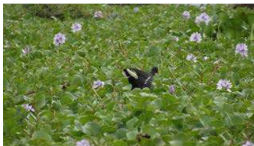
Water hyacinth, Eichhornia crassipes .

The response to comply to these global frameworks has yielded several continental and national frameworks especially outside Africa (Annexes 4 and 5). In the case of Africa, examples of conventions, guidelines and declarations at continental level that in part address (and/or expected to address) aspects of management of invasive species include among others, the following: (a) AU – IAPSC Strategy 2014 – 2023; (b) AU –IBAR Strategic Plan 2018 – 2023; (c) Policy Framework and Reform Strategy for Fisheries and Aquaculture in Africa (2014); (d) The African Convention on Conservation of Nature and Natural Resources; and (e) the African Strategy on Combating Illegal Exploitation and Illegal Trade in Fauna and Flora in Africa. A summary of these frameworks and regional workshops and their respective key objectives is presented in Table 1. These frameworks, strategies and/or guidelines are limited in scope and are not adequate for purposes of facilitating design and implementation of comprehensive continental-wide interventions for managing invasive species in Africa.