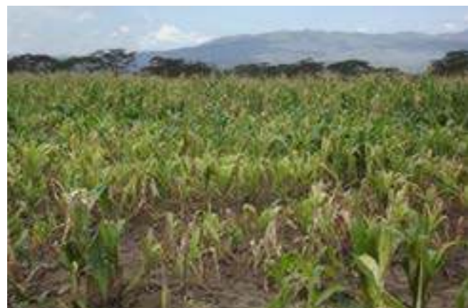
Maize lethal necrosis virus infection in maize field.

address all biological invasions that impact on all sectors of socio-economic development with the exception of Public Health pathogens as these are already adequately addressed in the other AUC frameworks. The existence of explicit frameworks (strategy and funding mechanisms) in part explains the proactive engagements associated with outbreaks of highly endemic invasive pathogens. Drawing lessons from these efforts underpins the need to reinvigorate and sustain Africa’s capacity to handle the invasive species challenge. This implies among others the need to secure instruments that are required for vigilance, predictive modelling, forecasting, monitoring/surveillance, data handling, institutional arrangements and governance structures. It is envisioned to have mechanisms and interventions for appropriate prevention and/or exclusion, early detection, control and management; and restoration and rehabilitation to avert the negative impacts from invasive species.