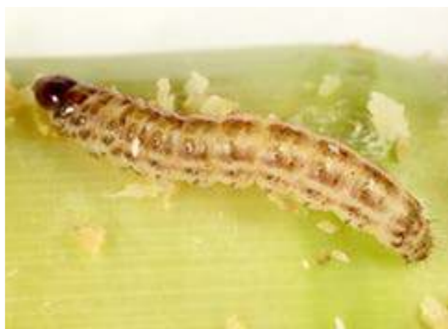
Spotted stalk borer. Chilo partellus larva.

An “Invasive Species Policy Summit”, held in association with CABI’s Member Country consultation in February 2019 in Gaborone, Botswana, urged countries to develop national invasive species strategies (as agreed by the Conference of the Parties to the Convention on Biological Diversity (CBD), but also emphasised the need for regional collaboration and coordination.