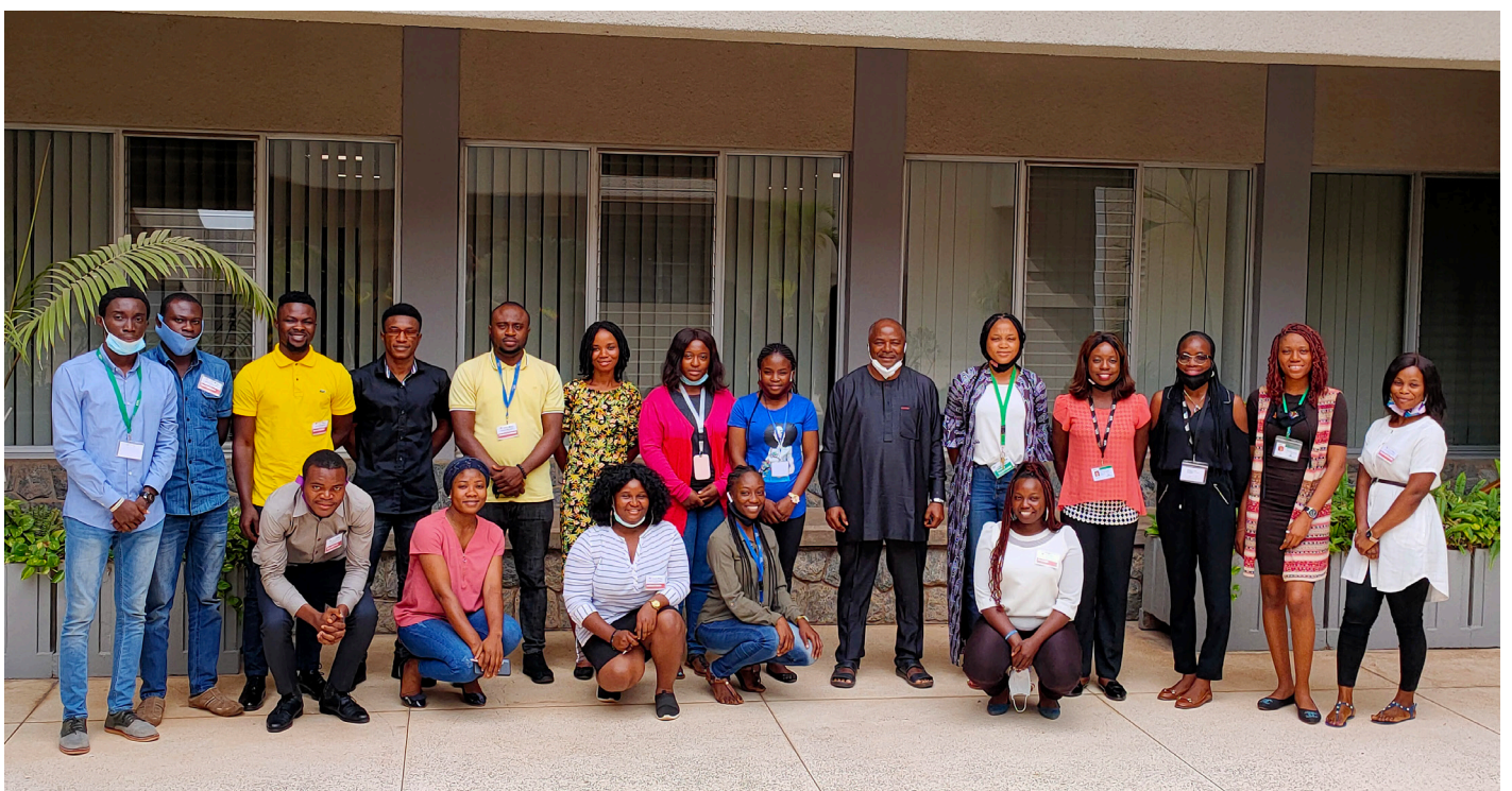
STEP-Oyo Team and the Director General.