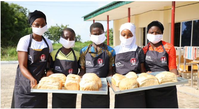
STEP students at Fasola showcasing baked products