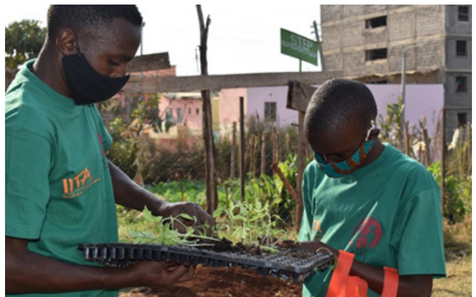
Peer-to-peer learning while receiving the Agribusiness Home challenge inputs

The students received farm inputs in form of seeds, seedlings and vines to plant at their home gardens while the harvested produce were either sold or consumed by their families.