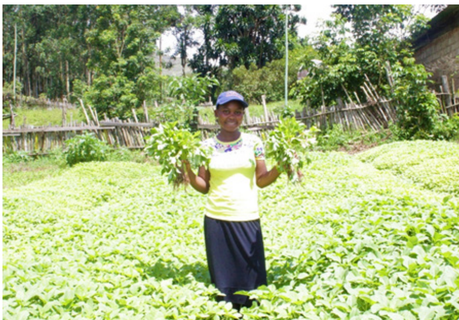
Harvest of amaranths in Weza by a student member of the vegetable growing club

The STEP team in DR Congo defied the challenges of COVID-19 to advance its work, helping young people demonstrate their ability to innovate in time of crisis, and deploying their time and skills against the impact of the pandemic on health, food supply, education and business