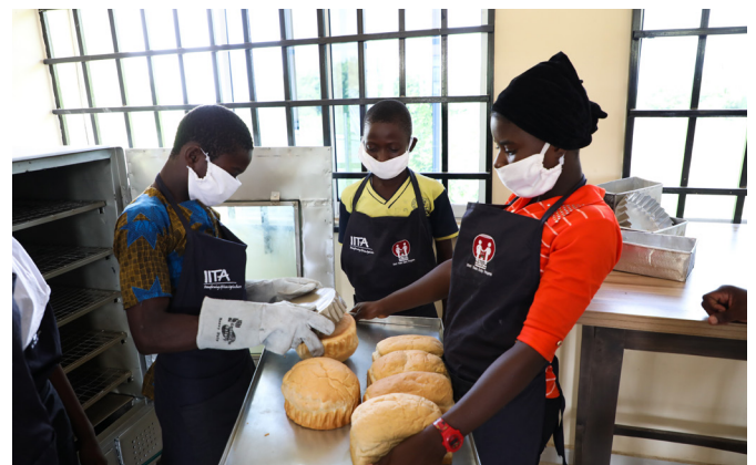
STEP students in Fasola carrying out a value addition process (baking)

Crop Production: The students are engaged in greenhouse agriculture for crop production. With STEP promoting the use of modern tools and equipment to attract and retain the interest of young people in agriculture, the students of Fasola are taught how to use small farm machineries to irrigate, weed and plant. They are also able to cultivate crops like maize, soybean and vegetables on the open field using modern agricultural techniques.