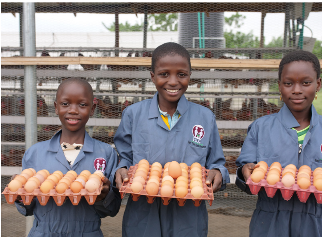
Eggs from the poultry