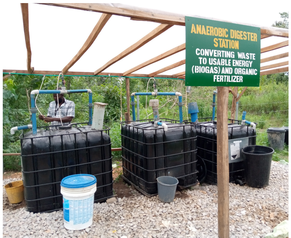
New school infrastructure; Renewable Energy (Biogas)

Three pilot agribusiness enterprises – crop production, animal production and food processing (value addition) - are currently operating in Fasola according to the STEP model. These enterprises are running on the standard greenhouse, two poultry pens, a processing centre and ICT facilities provided by STEP.