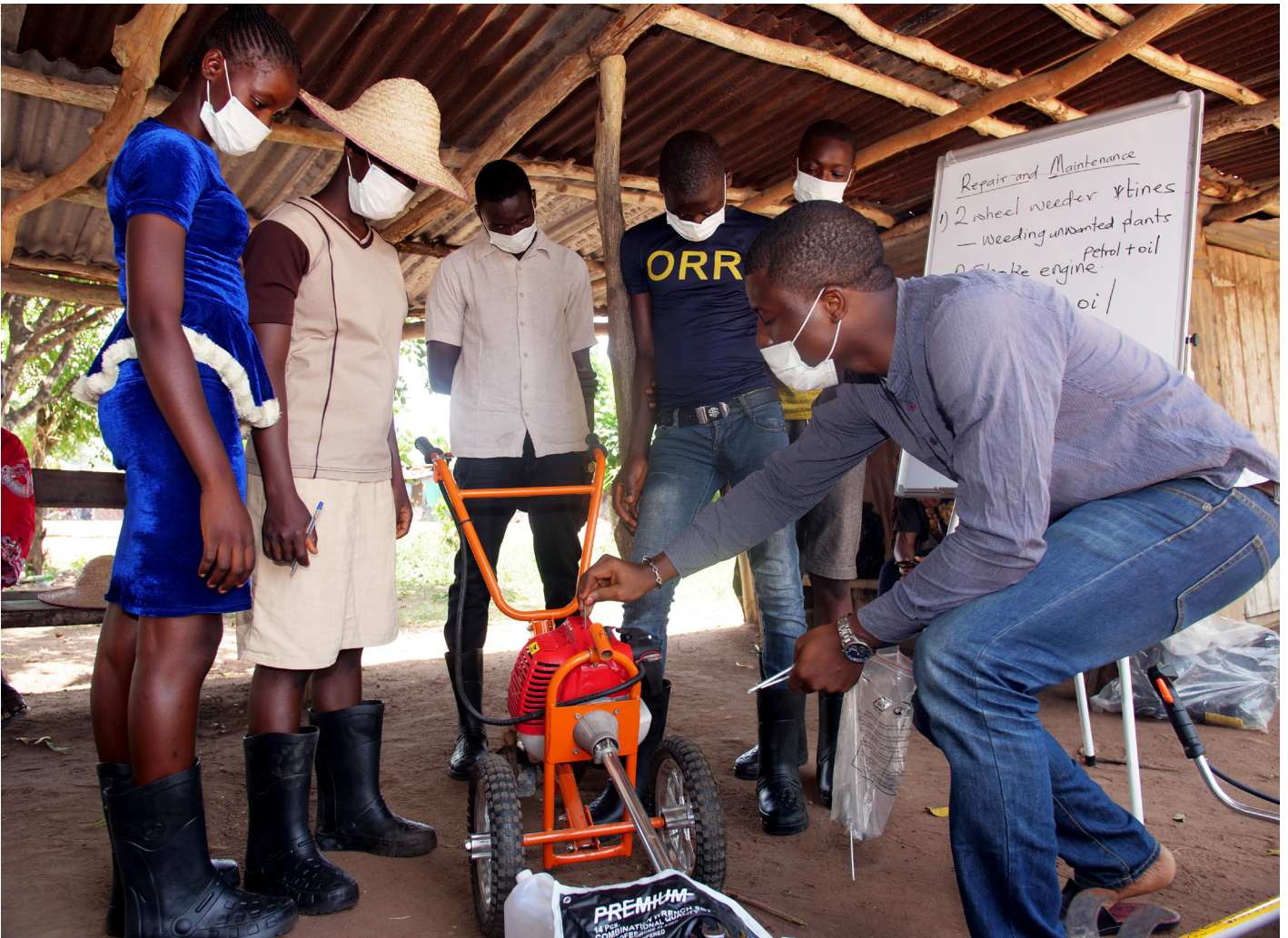
STEP students in Fasola being taught how to use a rototiller