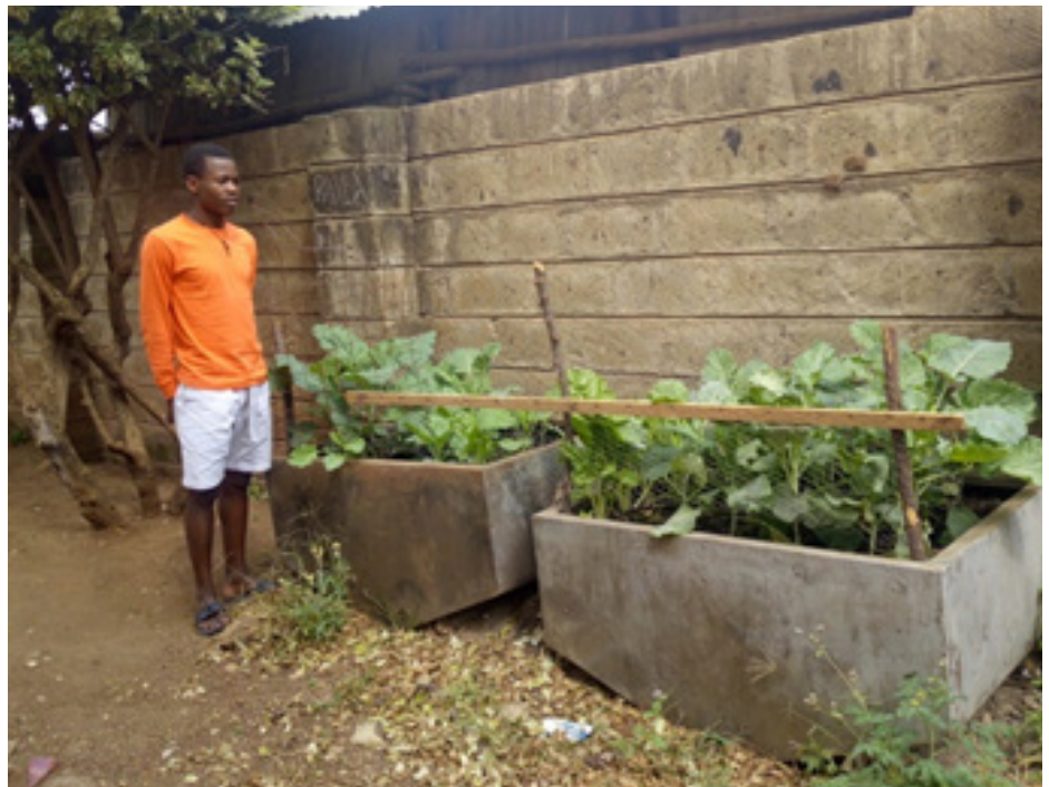
A student's project for the Agribusiness Home challenge.

To sustain interactions, the team used virtual meetings and developed an online learning platform for e-teaching and e-learning. The platform offers online and offline materials to students and teachers, with an assessment test feature to enable participants evaluate their progress. It also has interactive materials in form of Microsoft PowerPoint presentations, PDFs, illustrative videos, and gradable quizzes.