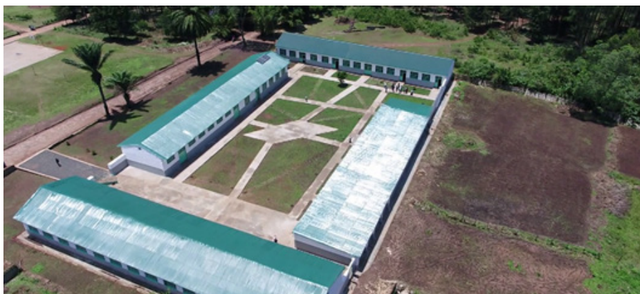
Weza, the training site for 5000 young people in agribusiness

They proposed ideas, led actions, organized discussions and disseminated information through social media and public awareness campaigns, saving many lives as a result.