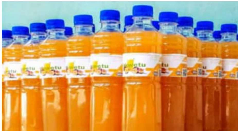
Maracuja juice produced by the STEP Club UEA team

While the pandemic forced a stay-at-home on many between March and August 2020, young beneficiaries of STEP showed leadership and became frontline workers in discharging roles ranging from tackling disinformation in their communities to implementing handwashing awareness campaigns.