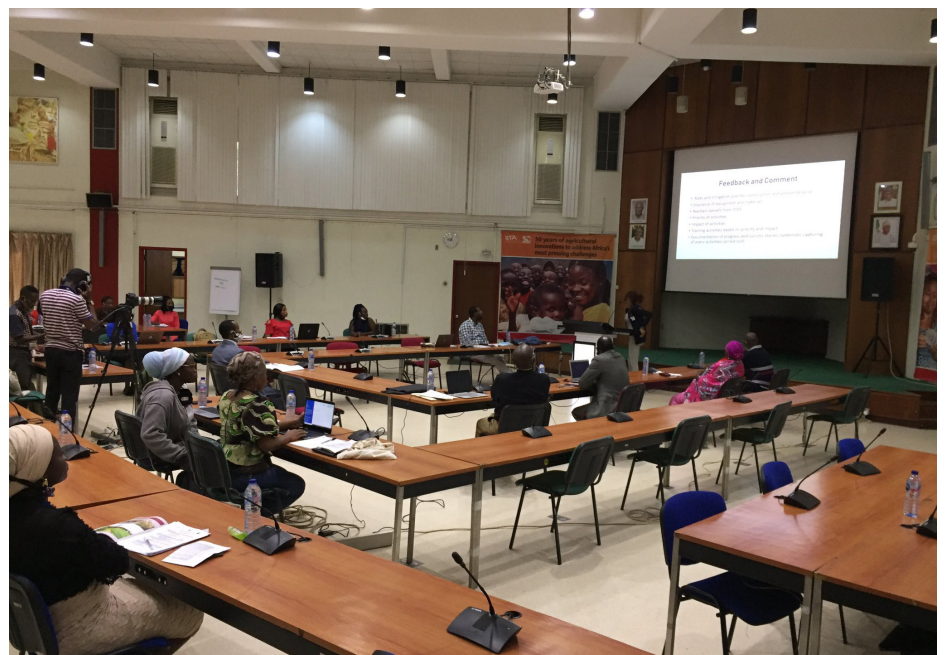
STEP-Oyo Implementation Planning Workshop in session

Prior to the take-off of the project in the two schools, the STEP Nigeria team, on 19 and 20 August, 2020, held an implementation workshop with support