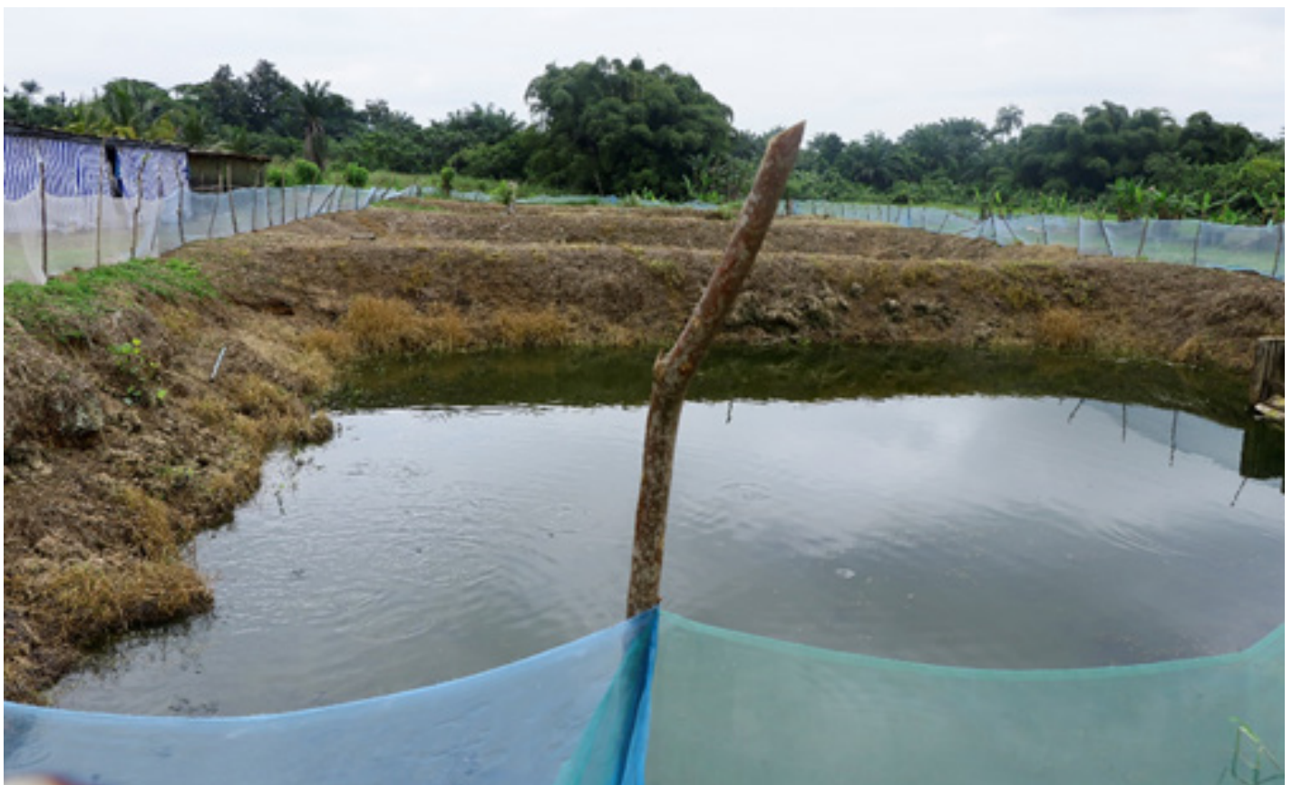
Fish pond facility at the Centre

and hostel facilities. Even though IITA and OFFERCentre are already partners on other projects, the partnership with STEP was predicated on the center's proximity to the Oluponna Community High School and the prospect of training the students in agriculture and agribusiness. OFFERCentre serves as a