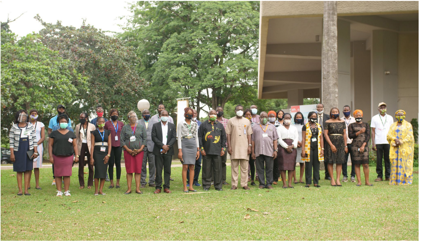
Group Photograph of Workshop Attendees.

the project, including its approach, objectives and key activities. It served as a platform for knowledge exchange and exploration of ideas on how to effectively and efficiently engage the students. The workshop leveraged the