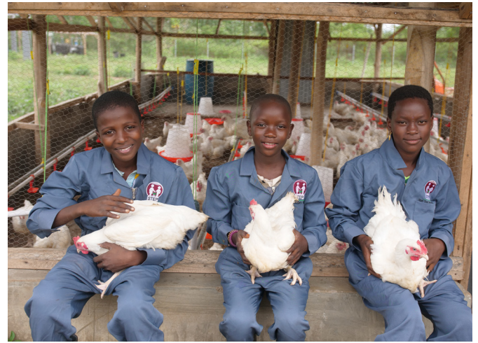
A few students of Fasola holding broiler birds