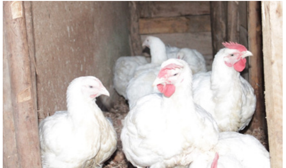
A student member of C5 in her henhouse at home