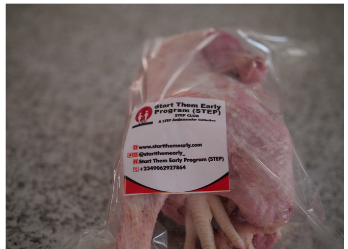
Processed broiler chicken packaged for sale