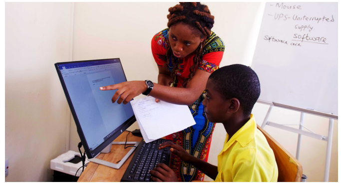
A STEP student in Fasola being trained on use of ICT.