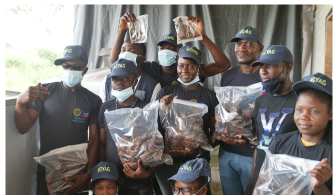
The beneficiaries displaying their products