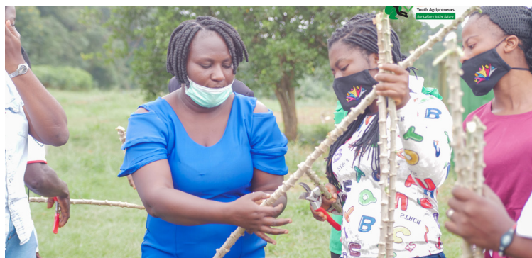
(L-R) IYA trained agripreneurs taking new trainees through the process of cowpea and cassava production