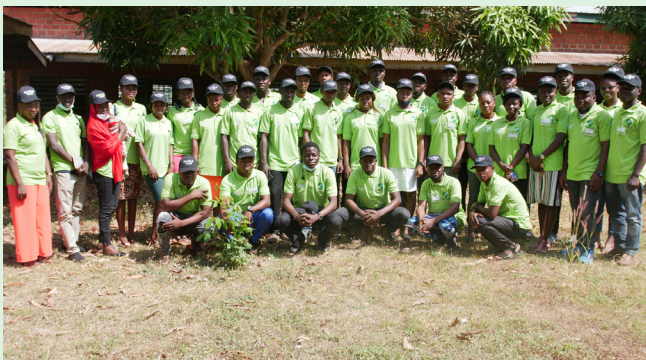
A group photograph of the beneficiaries during their induction at Awe

After training, ENABLE TAAT offers mentorship and backstopping to its beneficiaries. The compact also links them to loans and grant opportunities.