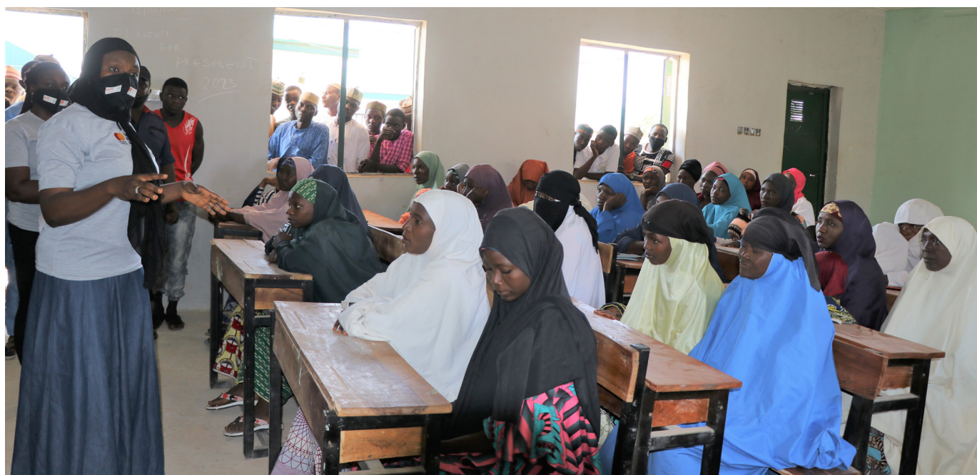
A staff of Young Africa Works-IITA sensitizing women on the need for them to participate in the program

The training program of the Young Africa Works-IITA project is scheduled to kick off on the 1st of February, 2021.