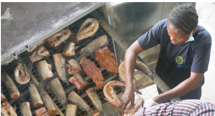
One of the trained youths in Warri producing smoked catfish

The project recorded the start-up of 40 agribusiness enterprises, establishment of two community based cassava processing centres and fish ponds, which are operated by the youths.