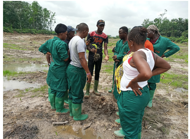
Field practicals with the beneficiaries

When it comes to employment or business opportunities, the youth in the Niger-Delta region of Nigeria mostly look in the direction of the oil industry. It was therefore a herculean task for the IITA Youth Agripreneurs who tried to sell the idea of agripreneurship in the creeks.