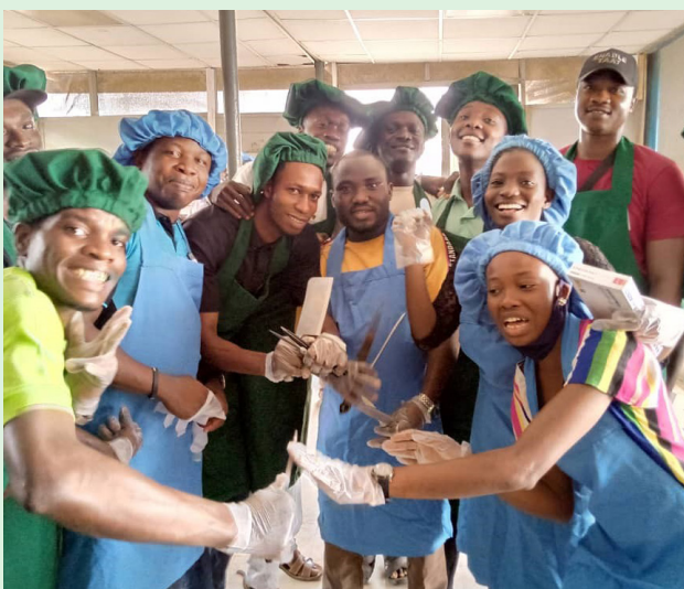
The trainees during a practical session on catfish value addition