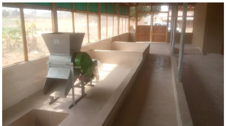
(L-R) Before and after look of a section of the processing centre.