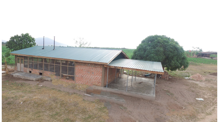
(L-R) Before and after view of the cassava processing centre at Awe