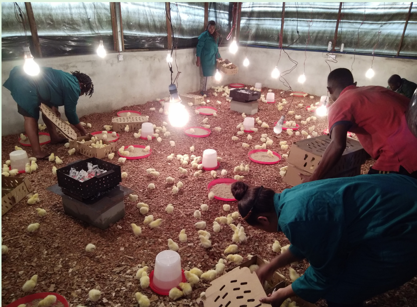
The trained beneficiaries stocking the first set of birds at the agribusiness park in Onne, Rivers state

A team of ENABLE-TAAT trained agripreneurs have recorded over N1million as gross profit, after two cycles of rearing live broiler. They also made 45 percent return on investment in 8 weeks of production. The agripreneurs who constituted a poultry cluster under the TAAT program attributed their success to the technical delivery of ENABLE-TAAT agribusiness park initiative, as well as the backstopping and monitoring activities provided.