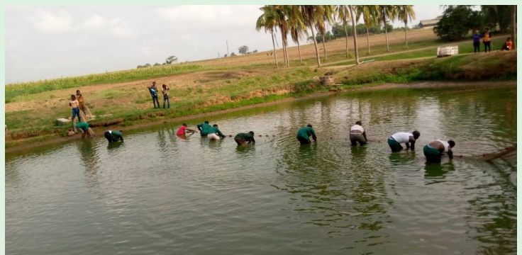
The trainees during a practical session on pond management