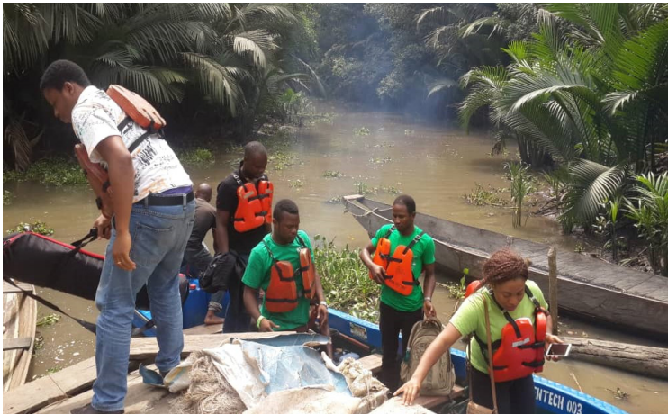
IYA team embarking on the first assessment visit to the creeks in 2016