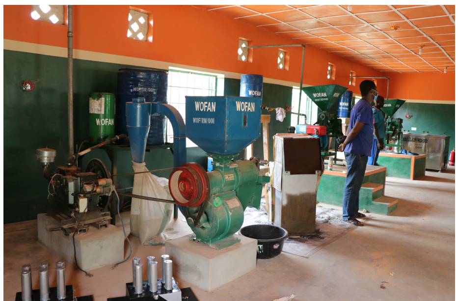
Some of the machines used for teaching women on value addition at the centre

The company is still aiming at training of local farmers in animal feed production, crop production such as rice, sorghum, maize, millet, groundnut, and soybeans. It also aims to change the negative attitude of people toward modern ways of agricultural activities and its production.