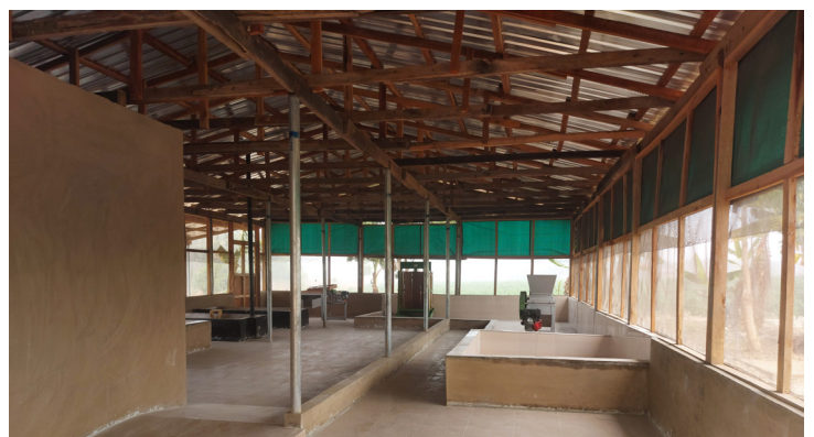
(L-R) Before and after look of the wet section of the processing centre.