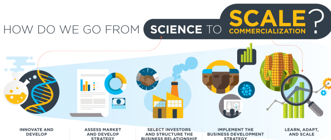
Exhibit 1. Science to Scale Commercialization

To facilitate the commercialization process, IITA received a grant from the Bill & Melinda Gates Foundation and the United States Agency for International Development (USAID) for implementation of a five-year initiative entitled Aflasafe Technology Transfer and Commercialization (ATTC), which is managed by IITA through the Business Incubation Platform (BIP). IITA hired Chemonics International, Inc. and Dalberg Advisors to support the implementation of ATTC. Aflasafe commercialization began in 2016 and has since expanded. Aflasafe is currently commercially registered and available in seven countries: Burkina Faso, The Gambia, Ghana, Kenya, Nigeria, Senegal, and Tanzania. As of October 2019, 12 more countries across Africa are at different stages in the pipeline for eventual Aflasafe