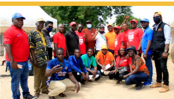
IAA team member during Biu Fair