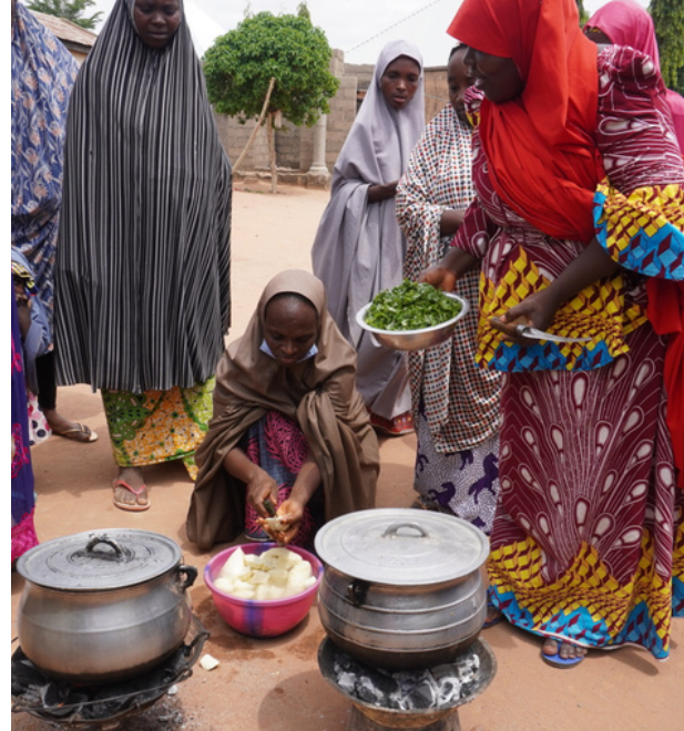
Meal preparation by women group members