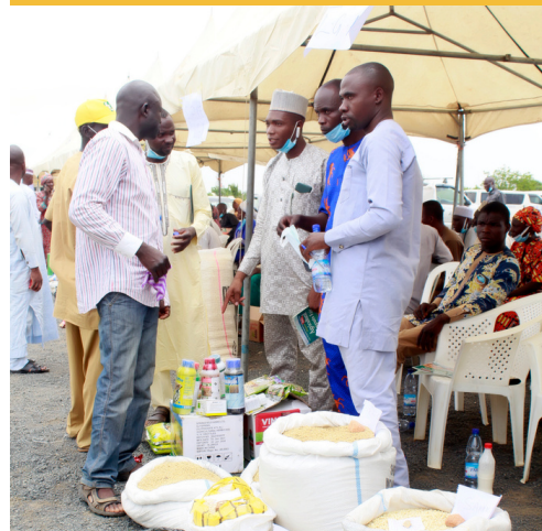
Certified Seeds on Sale by Community based Seed Producers at Yola Fair