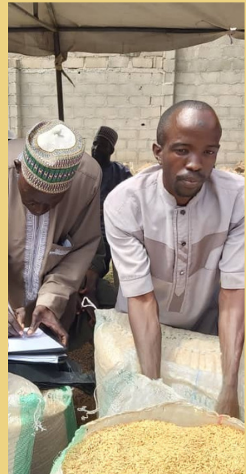
Selling Certified Seeds; Community Based Seed Producers at Biu, Borno