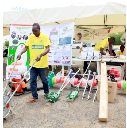
Products of Input and Equipment Supplier Companies and Certified Seeds of Community Based Seed Producers