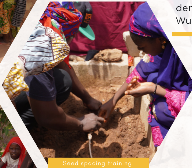
Seed spacing training