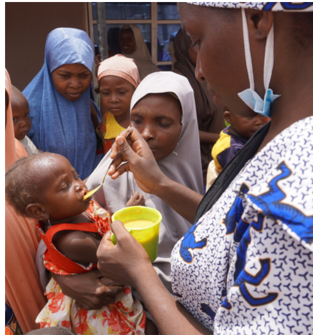
Demonstration on feeding the meal

NUTRITION: Malnutrition is most severe in North-East Nigeria, i.e. double the other parts of Nigeria. Diets are generally poor and inadequate in nutrients with 50 per cent of the children under five are chronically malnourished. The problem is being addressed through this programme.