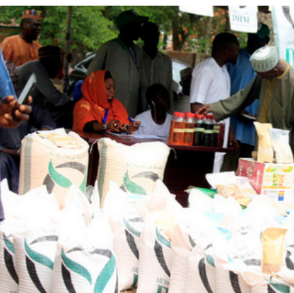
Selling Certified Seeds: Community Based Seed Producers at Biu