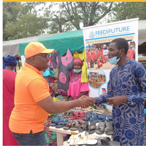
Entrepreneurs selling their products during fair at Biu