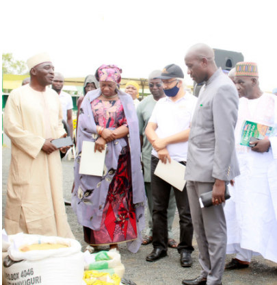
Hon. Commissioner for Agriculture Adamawa with Chief of Party IAA