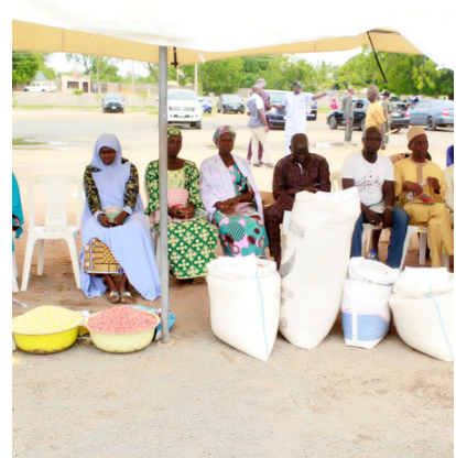
Community Based Seed Producers