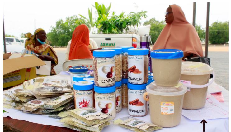
Input dealers & IAA entrepreneurs selling products during Fair