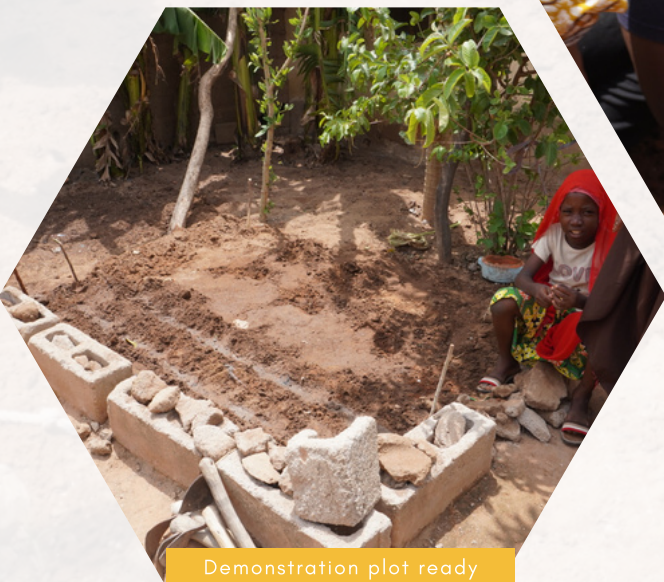
Demonstration plot ready