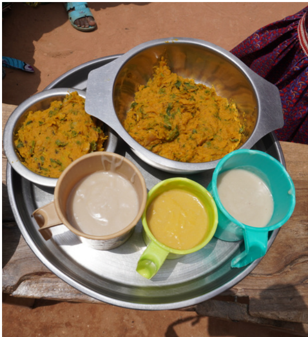
Ready to eat nutritious meal