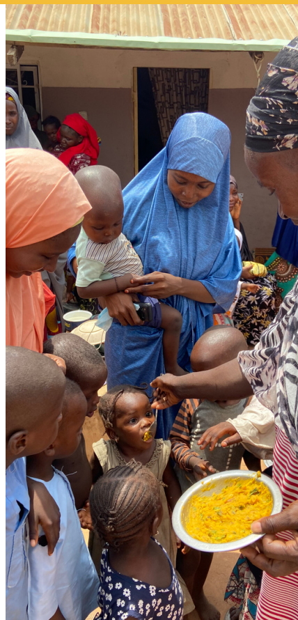
Demonstration of Nutritious Meal for Children in South Yola, Adamawa