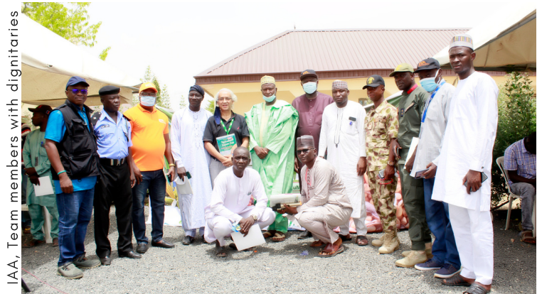
IAA, Team members with dignitaries