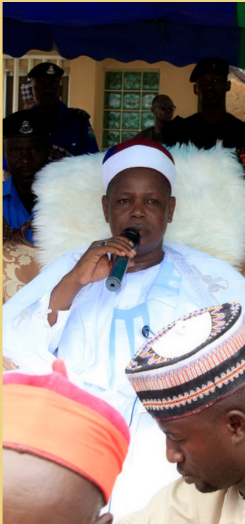
HRH Mustafa Umar Mustafa-II Emir of Biu, Borno