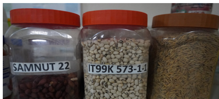
Varieties of Certified Seeds for Training purpose; at Yola Field office of IAA