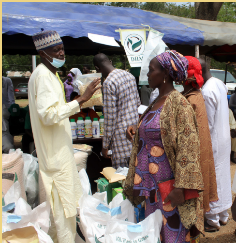
Community Based Seed Producers in Biu Fair

4 tons of Improved Certified Seeds of Groundnut, Maize, Rice, and Soyabean