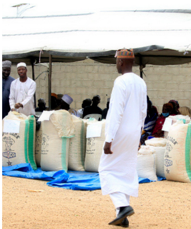
Community Based Seed Producers at Biu Fair