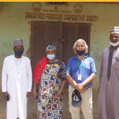
Chief of Party-IAA with Seed Producer group members