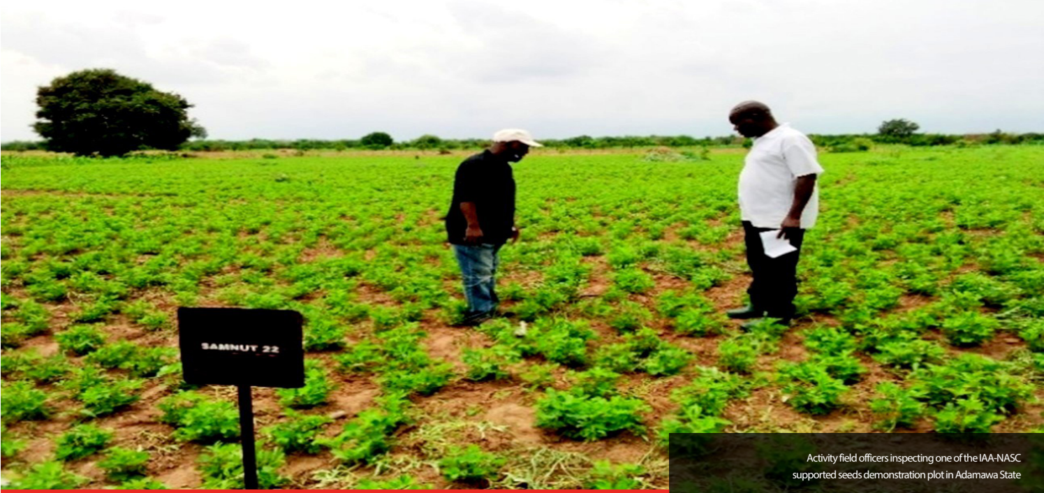
Activity field officers inspecting one of the IAA-NASC supported seeds demonstration plot in Adamawa State

The U.S. Government's Global Hunger & Food Security Initiative