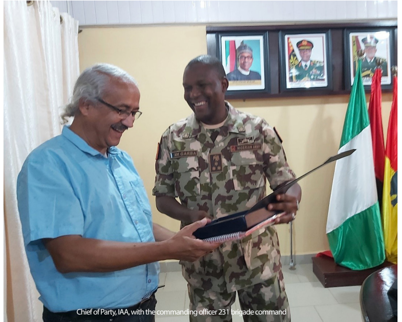
Chief of Party, IAA, with the commanding officer 231 brigade command

In the past decade, the Northeast has experienced a barrage of attacks from the insurgent group Jamā'at Ahl as-Sunnah lid-Da'wah wa'l-Jihād popularly known as Boko Haram. The group's activities in the region caused several people to abandon their homes and livelihoods. As government is trying to restore peace in the region, there is also the need to support the affected people's livelihood and contribute to the economic recovery of the region which has been seriously battered by the crisis. In view of this, USAID and other international and Local donors have intervened and supported with several development and humanitarian projects which also included the Integrated Agriculture Activity which has the objective of supporting selected vulnerable households to get back their livelihoods. Meanwhile, the evolving security challenges in the region have continued to pose a threat in the implementation of the projects in the region. This has made security a top priority for the Integrated Agriculture Activity to secure the staff and contribute to intelligence and security information gathering