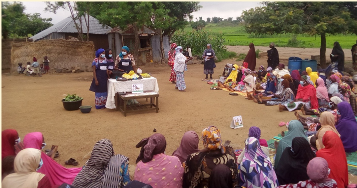
NLOs conducting step down of micro processing of legumes and cereals in Sakwa community, Hawul LGA, Borno State during a nutrition food demonstration session

The U.S. Government's Global Hunger & Food Security Initiative