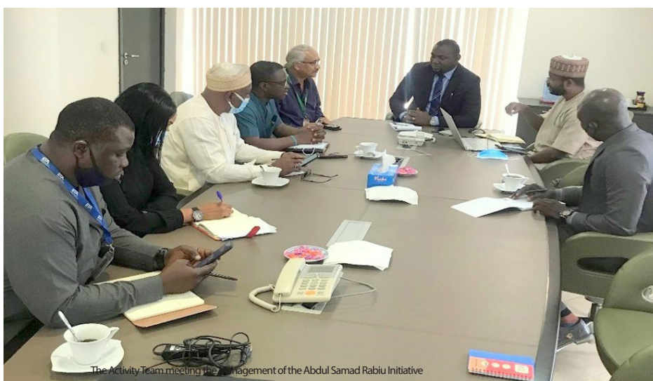
The Activity Team meeting the management of the Abdul Samad Rabiu Initiative

The Chief Party Integrated Agriculture Activity led a delegation of staff from the Activity to the ASRI office in Abuja in September 2021 to explore possibilities for partnership. The interaction of IAA with management team of ASRI provided deep insights into areas of collaboration which could be activated to improve the livelihood of vulnerable populations in the Northeast. The delegation learned about the ASRI's operations, what their priority focus was for this year and beyond. The partnership when eventually finalized is expected to improve incomes of households in Northeast Nigeria.