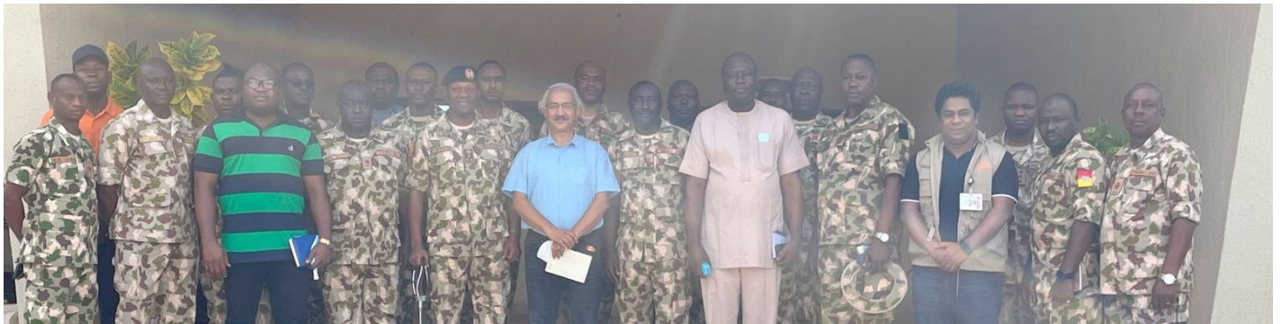
Group photograph of the Commanding officer, 231 brigade command and senior officers with the Activity's team in army barracks, Yola, Adamawa state

that will help the smooth implementation of donor funded Activities in the region. To this end, the IAA in collaboration with the government of Adamawa state, other INGOs and relevant security agencies in the state organized the Northeast Safety and Security Seminar which was aimed at generating ideas on how best to implement development and humanitarian projects in the Northeast amidst the rising security and safety challenges in the region. The seminar tagged "Safety and Security for the Sustainable Development of Agriculture in North-East Nigeria" adopted the methods of Prevention, Detection and Response in dealing with the security challenges and to achieve this, it has become paramount to have a joint platform where security and safety information with the peculiarity of the Northeast can be shared as noted and jointly agreed at the seminar.