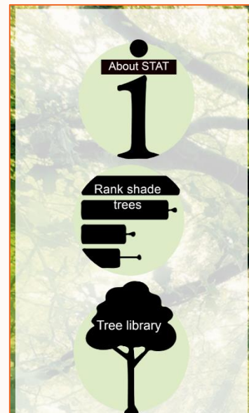
Shade Tree Advice Smartphone Application

IITA Uganda and its government and private partners is promoting increased smallholder coffee farmer adoption of Climate Smart Agriculture (CSA) practices in Uganda. Initial IITA research on coffee in Uganda began in 2006 and has spread across 30-districts, with 58 field trials, and 178 demonstration plots established and more than 4,000 participating farmers. IITA supports the work of the Uganda Government through the National Agricultural Research Organization (NARO), Ministry of Agriculture, Animal Industry and Fisheries (MAAIF) and Uganda Coffee Development Authority (UCDA) agricultural policies and sub-sector strategies and plans. Working with the public and private partners such as Olam, Kawacom, Great Lakes Coffee, and Hanns R. Neumann Stiftung (HRNS), IITA has developed and tested a number of CSA tools and approaches such as the Stepwise approach ( https://www.iita.org/wp-content/uploads/2019/10/Final_Brief_StepwiseApproach_21022019.pdf ), a climate smart investment pathway for smallholder coffee farmers. The Stepwise approach is complemented by decision support tools: the Stepwise Smartphone Application ( https://www.iita.org/wp-content/uploads/2019/10/Final_Brief_StepwiseSmartphoneApplication_190303.pdf ) and the Shade Tree Advice Smartphone Application which can be found on play store https://play.google.com/store/apps/details?id=com.mangotree.stepwise