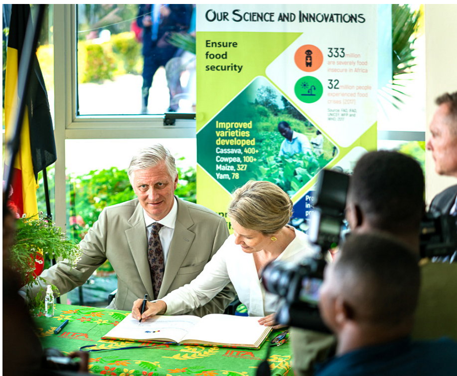
King Philippe and Queen Mathilde signing the guestbook.

Their Majesties, King Philippe and Queen Mathilde of Belgium, with the representatives of the Belgian community in the Democratic Republic of Congo, visited the President Olusegun Obasanjo, IITA Research Campus, during their visit to South Kivu on the recommendation of the President of the Republic, His Excellency, Félix-Antoine Tshisekedi Tshilombo.