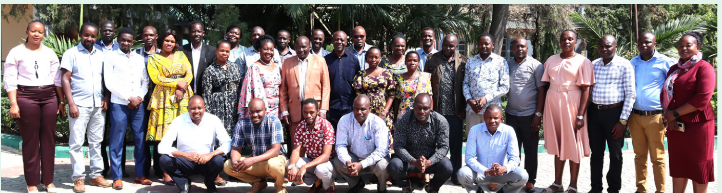
Stakeholders in the Muhogo Bora project come together in a workshop.

The Muhogo Bora (MB) project brought together 28 regional and local government authorities comprising Regional Agricultural Advisors (RAAs); District Agricultural, Irrigation and Cooperative Officers (DAICOs); Regional Community Development Officers (RCDOs); and District Community Development Officers (DCDO) at a workshop held on 16 August at Nazareth social hall in Tabora Region, Tanzania.