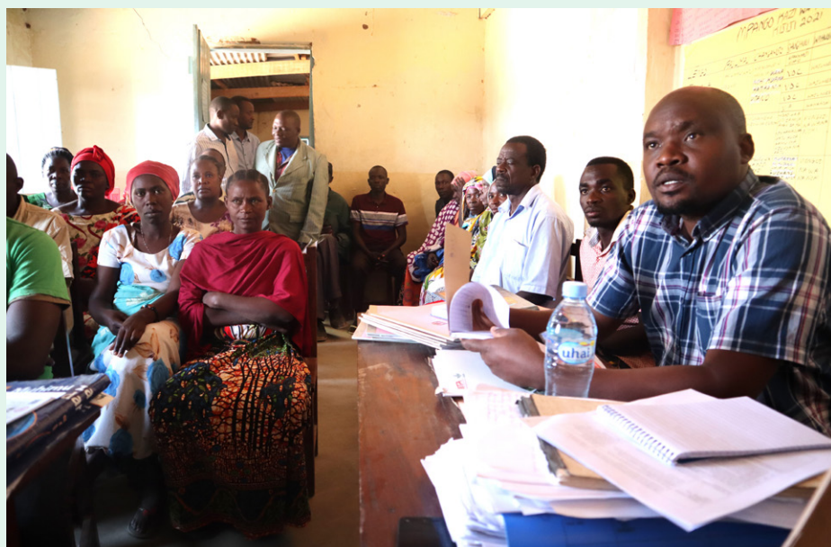
Top: Workshop participants engaged in a group exercise.