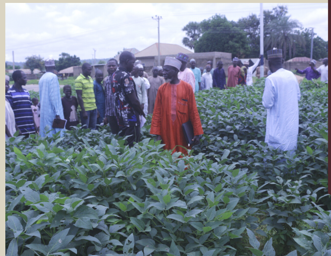
Farmers at an IAA Green Field Day in Borno State

and soil fertility enhancement. Using the demo-plot examples, he reinforced the advantages of good agricultural practices (GAP) as promoted by the International Institute of Tropical Agriculture (IITA) and supported by USAID.