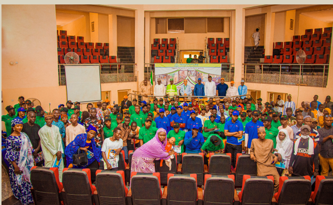
A photograph of invited guests and trainees at the Youth and Women Vocational Skills Graduation Ceremony

60 Master Trainers and 24 Community Development Officers also received certificates of appreciation for their contributions toward the success of the training programme. The vocational skills training is geared towards ensuring that the youth and women population in the 12 intervention LGAs of Adamawa and Borno are gainfully employed in farm and non-farm activities thereby promoting income generation and reducing unemployment in the northeast region.