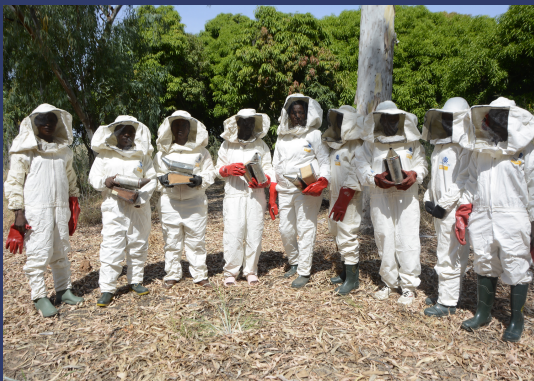
Fully Kitted: Trainee women ready to visit the hive for practical during the two-day training

commitment to improving the livelihood of young people and women in the northeast is at the core of USAID's many interventions, especially through the Activity. Mr. Archibong also said that many of these interventions encourage young people and women to take entrepreneurial opportunities available within their communities seriously. He promised that these interventions will continue during the expanded scope of the Activity in 2023 and 2024.