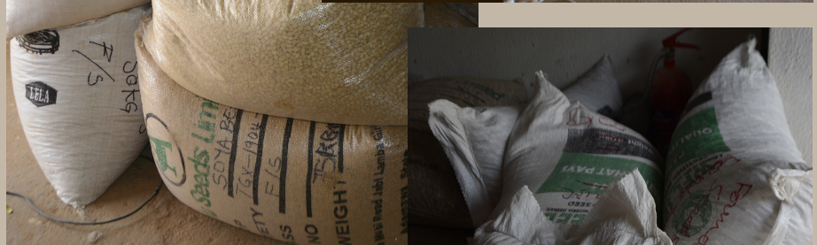
Some of the bags of seeds remitted to the Activity