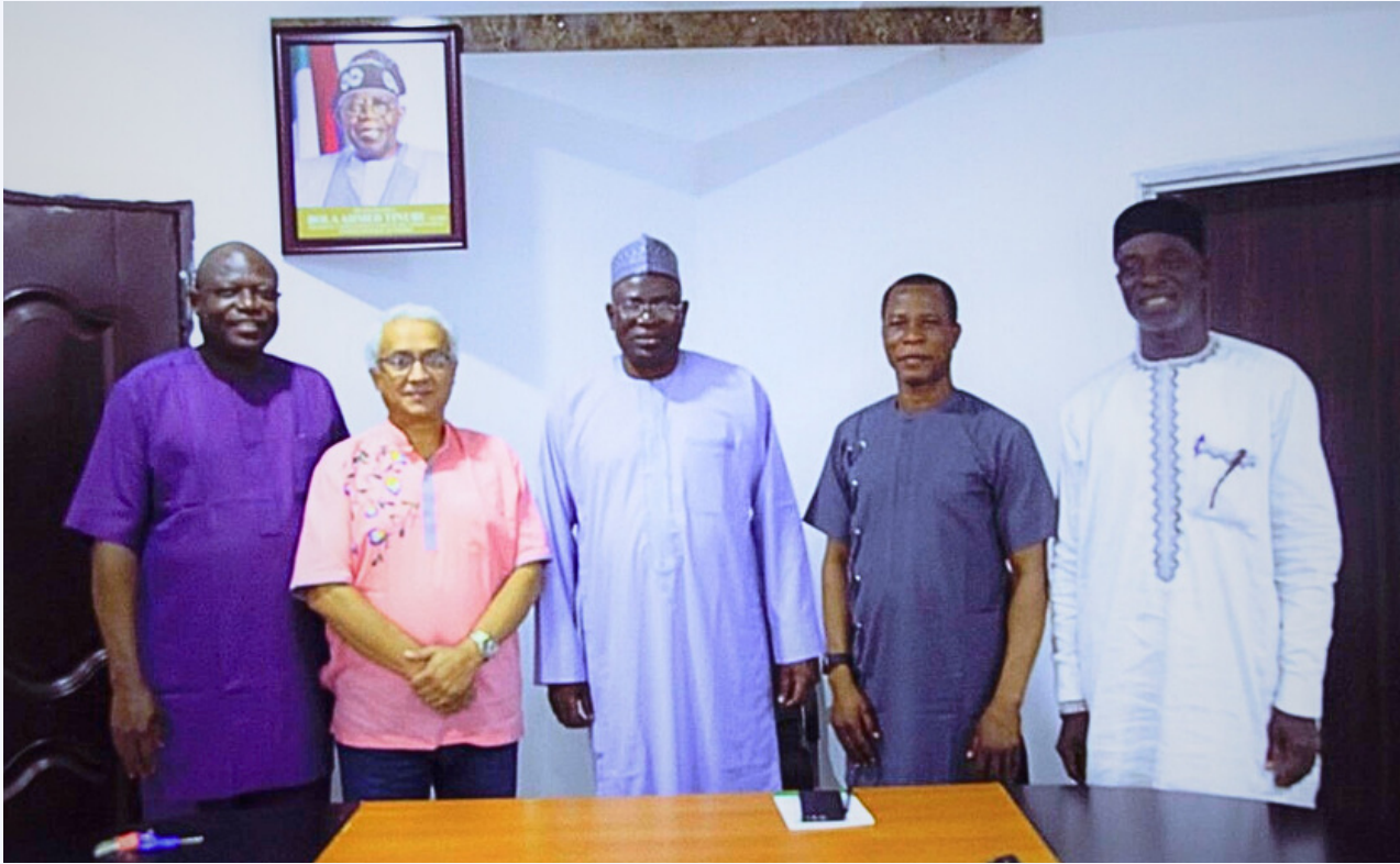
Participants at the first IAA- NASC partnership committee meeting.

The U.S. Government's Global Hunger & Food Security Initiative