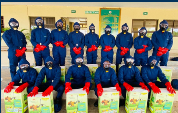
Closing ceremony in Gombe: Participants fully kitted in their PPE pose with their knapsack sprayers.