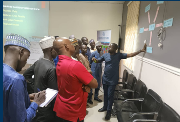
Integrated Pest Management session during the training in Gombe.

Feed the Future Nigeria Integrated Agriculture Activity has empowered 30 youth from Gombe and Yobe States with Spray Service (SSP) skills. Participants were drawn from Akko, Billiri, & Kaltungo (Gombe) as well as Potiskum, Nangere and Fika (Yobe). The one-week training was organized in collaboration with CropLife Nigeria. The training started on July 17, 2023, and July 24, 2023, in Gombe and Yobe respectively.