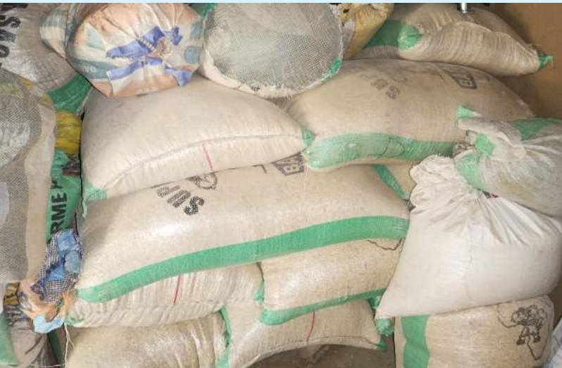
▲ Photo: Mariam Ali's Harvested Seed Storage

By September 2024, Mariam's micro-processing has blossomed into a thriving business producing a range of nutritious snacks including ready-to-use therapeutic food (RUF), popcorn, tofu, and peanuts. These products not only met local demands but also provided a sustainable livelihood stream for Mariam's family, with weekly profits soaring between 3,500 to 5,000 naira, which boosted Mariam's entrepreneurial spirit.