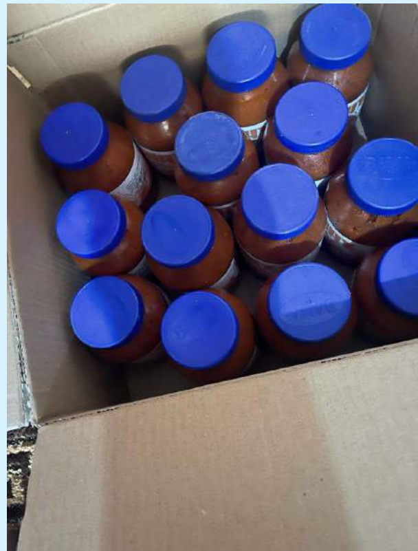
▲ Photo: Fatima’s Tomapepo bottles ready for the market

“Early last year, my neighbour’s child was to get married and the tomatoes they bought for the catering wasn’t enough, so I dashed out to my house and brought my products. I seized the opportunity to introduce my Tomapepo to them; they were amazed because it had all the required ingredients, so they bought five big jars. In addition, I regularly sell to a food vendor who sells food in the central market and routinely reinvest the money from sales. This business is special for me because I am retired and I rely solely on my pension which often comes late. I usually do not do anything when the farming season is gone, but now I am engaged and get extra money from the Tomapepo