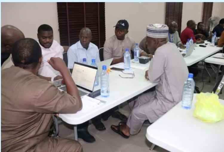
◀ Sub-team celebrations at the meeting