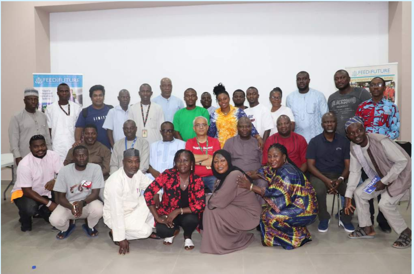
▲ Group photograph at the end of the sessions