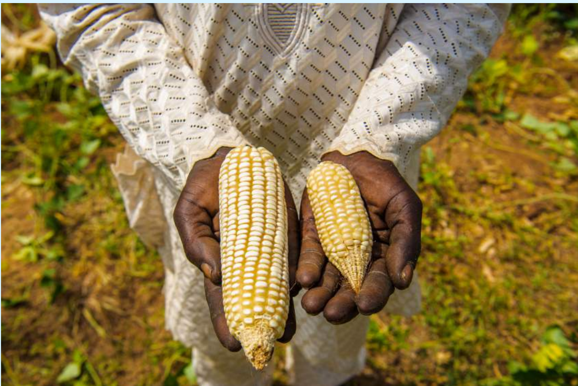
▲ One of the improved maize varieties made available by IITA, SAMMAZ 15, on the left and local maize variety on the right from the Activity's Demo plot at Munga community in Hong LGA.

Stay tuned for further updates and registration details in the upcoming months. Together, we can make a difference in the lives of millions of Nigerians.